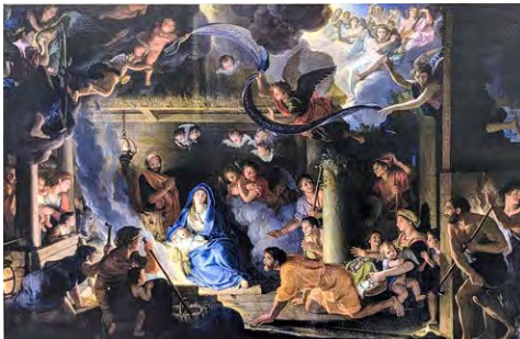
Adoration of the Shepherds, by Charles Le Brun