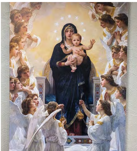
The Virgin with the Angels by William Adolphe Bouguereau