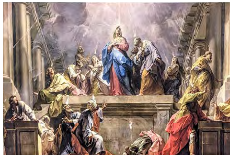
Pentecost, by Jean Restout