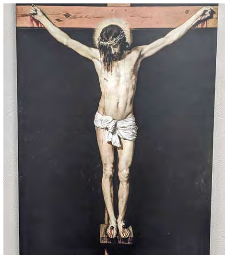
Christ Crucified by Diego Rodriguez Velazquez