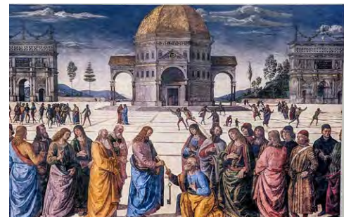
Giving the Keys to St. Peter, the Sistine Chapel by Pietro Perugino