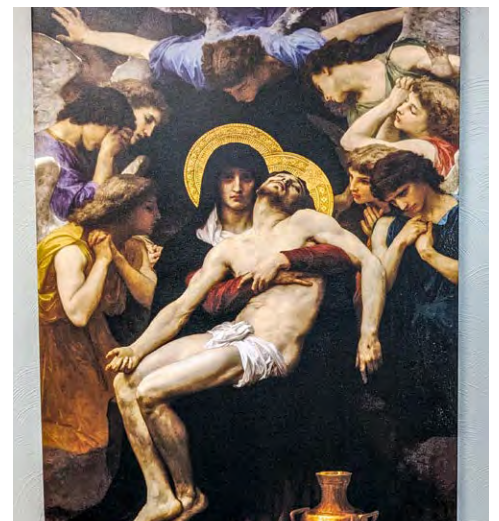
Pieta by William-Adolphe Bouguereau