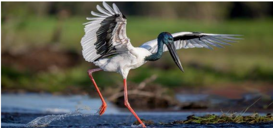
Hear the birdsong