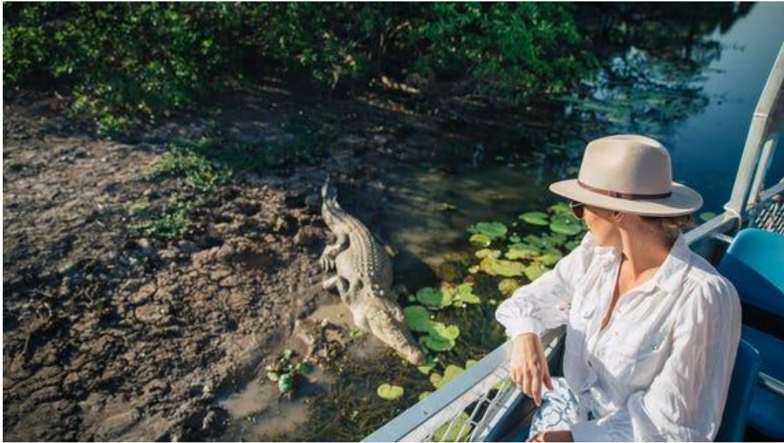
Yellow Water Billabong