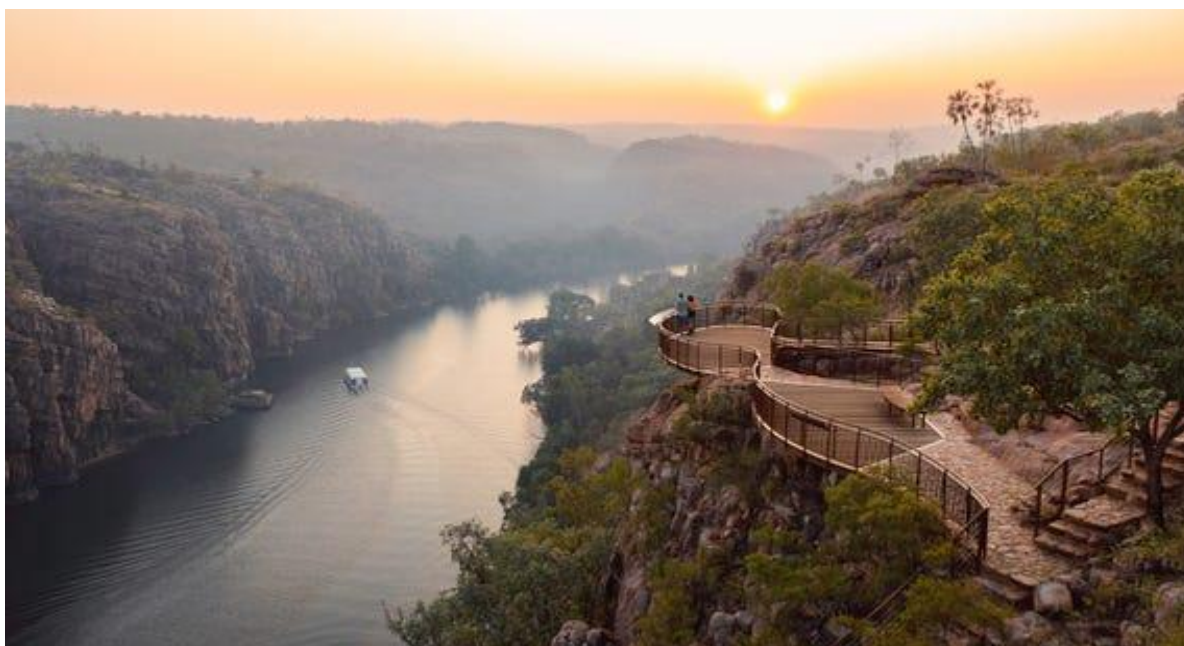
Hike around Katherine Gorge

We hope you enjoy your visit to the Northern Territory - where sensory travel really is different in every sense.