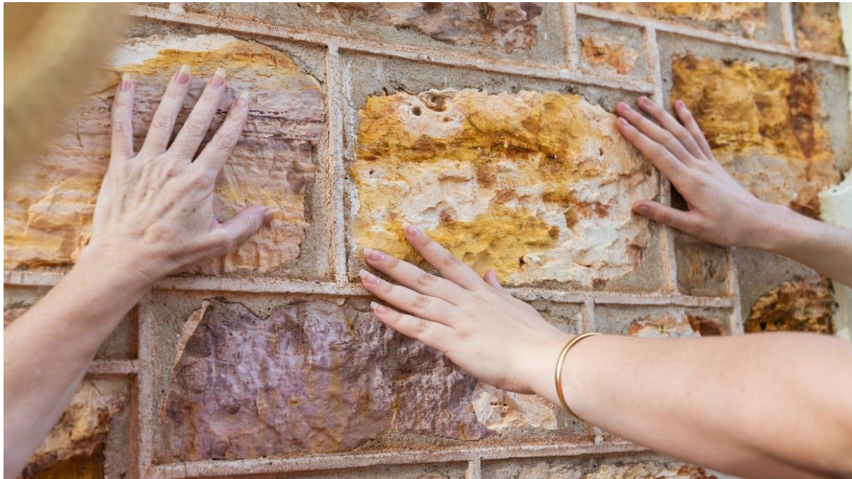
Historic buildings in Darwin

Cyclone Tracy was also a defining moment in Darwin's history - a category 4 tropical cyclone in 1974 that destroyed 70% of the city. Head into the Museum and Art Gallery of the Northern Territory and make your way into the Cyclone Tracy exhibit, where you can hear the devastating roar of the cyclone as it hits the town and learn about the day that changed the urban landscape and the lives of Darwin's residents forever.