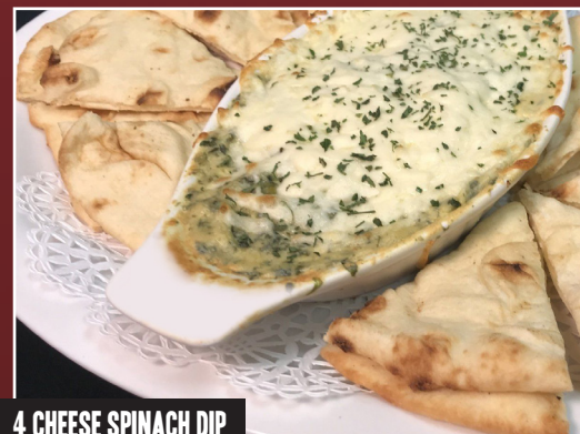
4 CHEESE SPINACH DIP

DELICIOUS, MOUTH WATERING APPETIZERS 1/2 PRICE AFTER 4PM THURSDAYS (Dine in only, limit one appetizer per person)