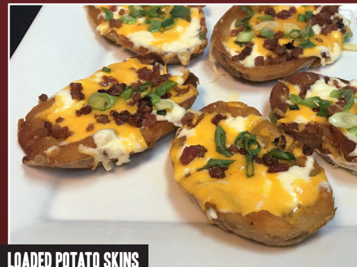
LOADED POTATO SKINS