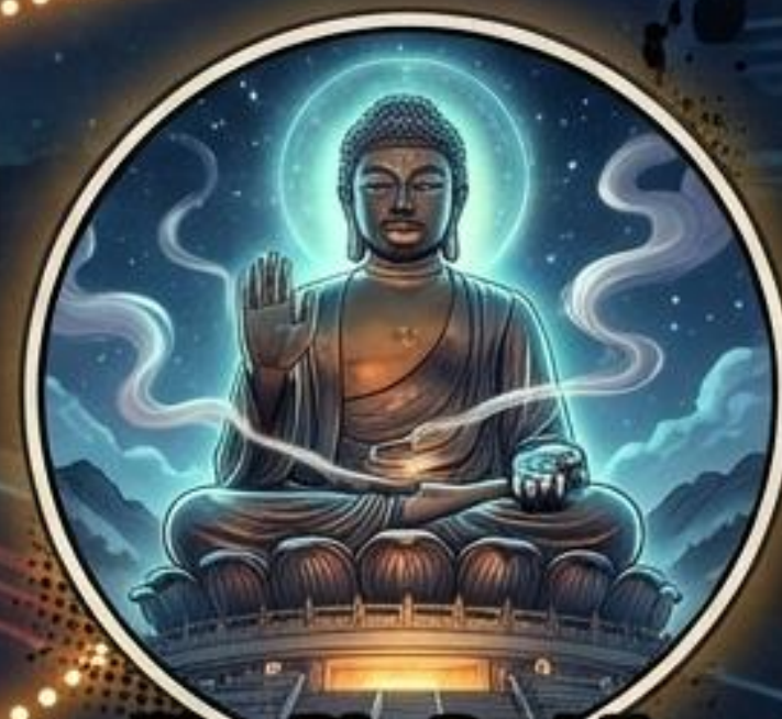
The Big Buddha