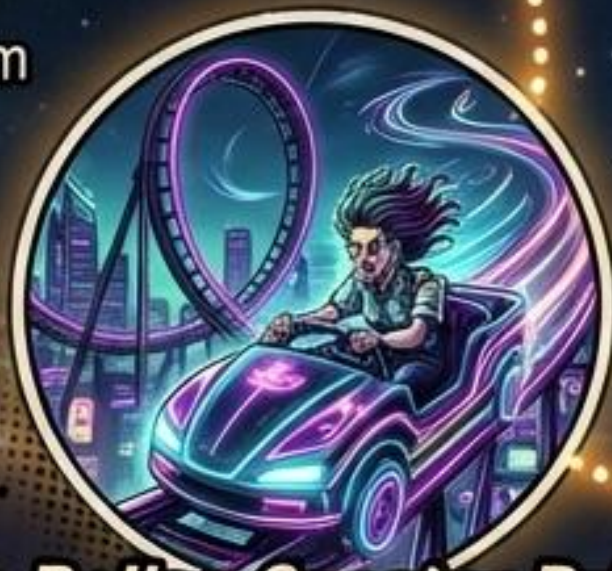
The Roller-Coaster Driver