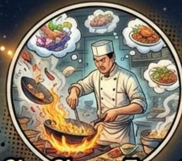
The Cha-Chaan-Teng Chef