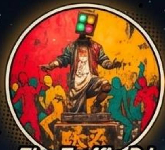
The Traffic DJ