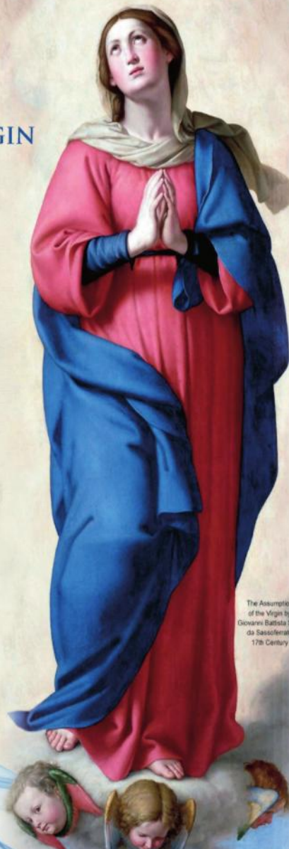
The Assumption of the Virgin by Giovanni Battista Salvi da Sassoferrato 17th Century

Blessed the people the Lord has chosen to be his own.