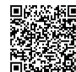
QR Code for Marketplace