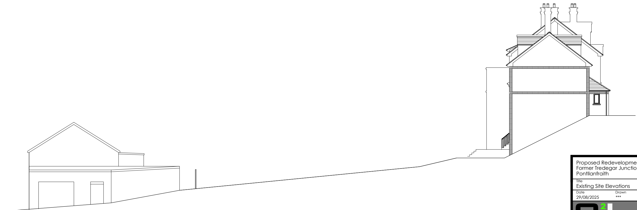
North Elevation 1:200 @ A3