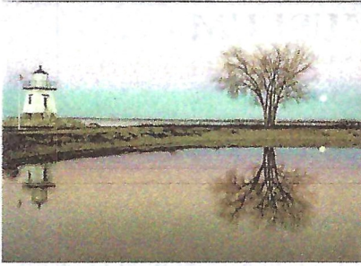
First entry in the Lighthouse Photo Exhibit (by Clair Jeremy)

Get ready—shoot! Do you like to take photos of the Port Clinton Lighthouse? Then, this is for you! We are accepting up to two 5"x7" or 4"x6" photo prints from individuals for display in the museum all summer. This is not a contest, but an opportunity for everyone to see each others' creativity, just as many of you have already shown on Facebook. We will have an area for artistic or realistic photos, and we are also planning to display "selfies" that include the lighthouse. We have a committee working on the plans, and we have the first photo (left) and several others. We will be asking you to give us permission to keep and use your photos, but in any case, we probably will not be able to return them. You can stop in when we are open, mail them in, or hang them on a door in a plastic bag. We want hundreds of photos! (Applications at Museum and Library.)