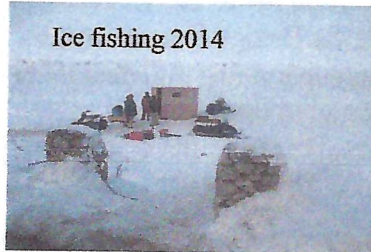
Ice fishing 2014

From the Curator —For several years I have been involved with the Historical Society's oral history project, which has produced 6 books of oral histories from around the county. The latest, Volume 6, is titled The People of Ottawa County, Memories & Adventures , a collection that includes oral histories related to the Ford Tri-Motor, the airport, and the