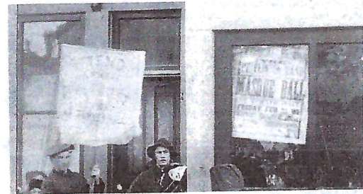
Some of our fun-loving forebears promoting the 1885 Masque Ball at Turner Hall (across from museum).