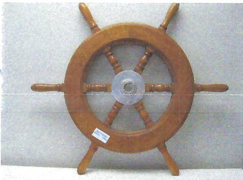
See below for information about this artifact.

Non-Profit Bulk Rate U.S. Postage PAID Permit No. 118 Port Clinton, OH 43452