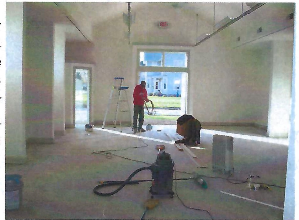
November 4, 2009—Seaway Building Services painter finishes painting the interior.

From the morning of August 11 th , when the first contractor set foot on the property, the addition to your museum has rapidly progressed. We have been fortunate to have such dedicated professionals who have helped us keep within our means by pointing out ways to save and by donating some of their time and materials. Please join your fellow members in thanking them when you have an opportunity: