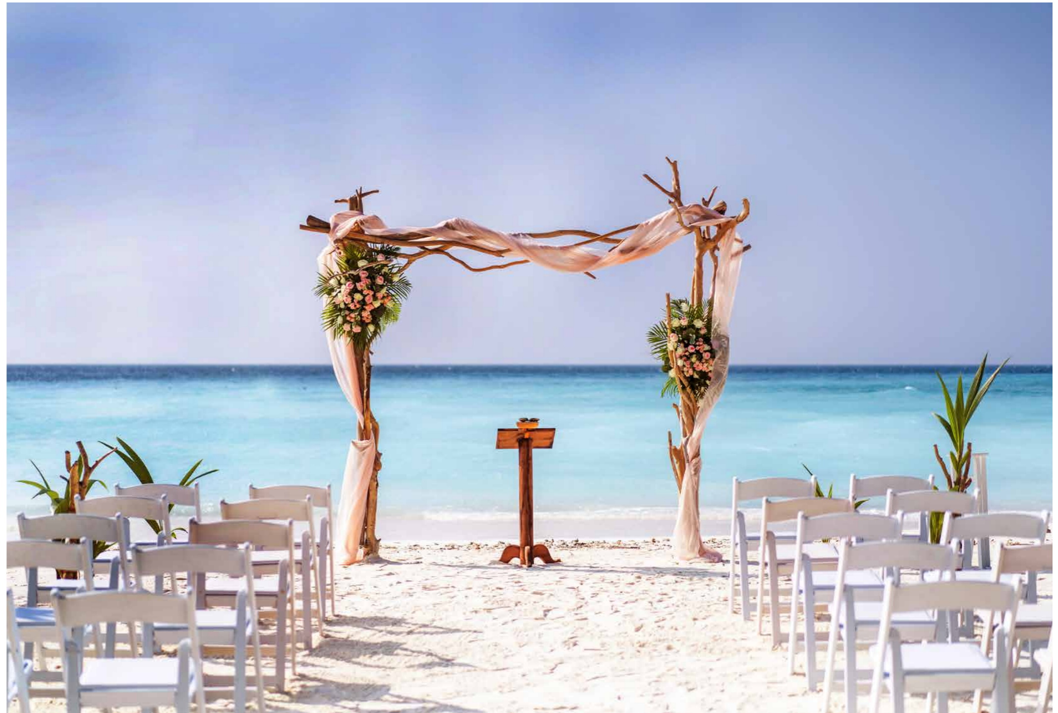
ISHGI "ROMANTIC" (USD 1600++)