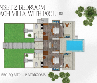
SUNSET 2 BEDROOM BEACH VILLA WITH POOL 08