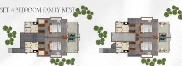
SUNSET 4 BEDROOM FAMILY NEST

232 SQ MTR - 4 BEDROOMS (2 UNITS OF SKY SUITES AND 2 UNITS OF BEACH SUITES)