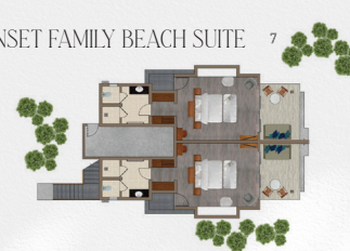
SUNSET FAMILY BEACH SUITE 7