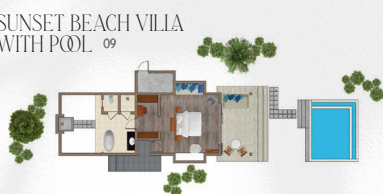
SUNSET BEACH VILLA WITH POOL 09