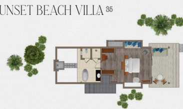
SUNSET BEACH VILLA 85