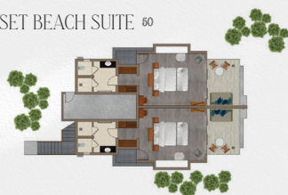
SUNSET BEACH SUITE 60