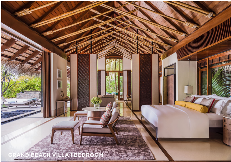
GRAND BEACH VILLA | BEDROOM