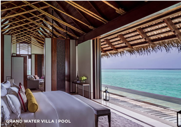
GRAND WATER VILLA | POOL