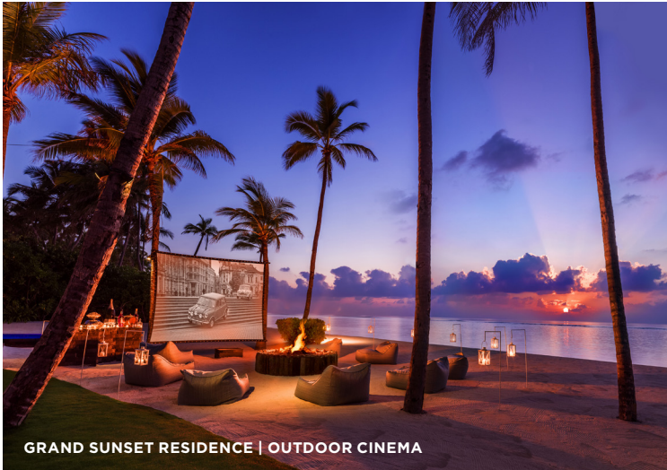
GRAND SUNSET RESIDENCE | OUTDOOR CINEMA