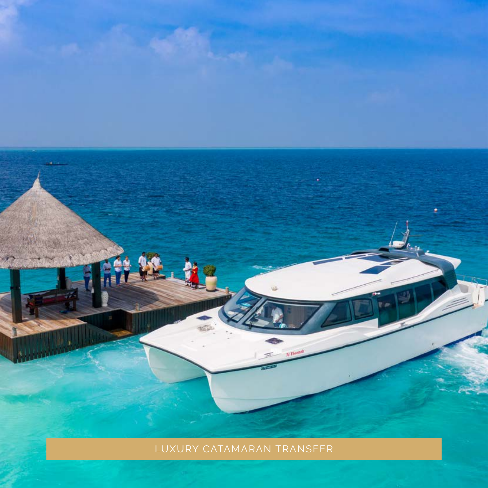
LUXURY CATAMARAN TRANSFER