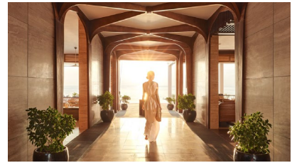
Crafted for every celebration