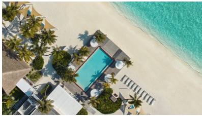
Three restaurants & two bars