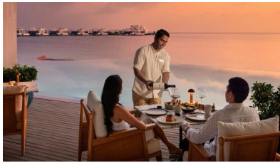
Sip by the Indian Ocean