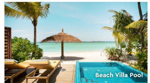
Beach Villa Pool