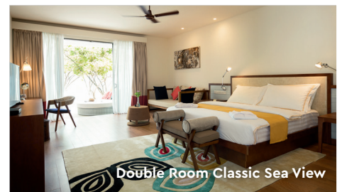
Double Room Classic Sea View