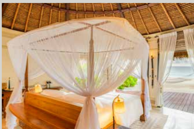
Beachfront Pool Villa (110sqm)