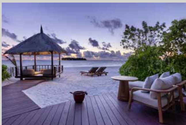
Beachfront Sunset View Pool Villa (110sqm)