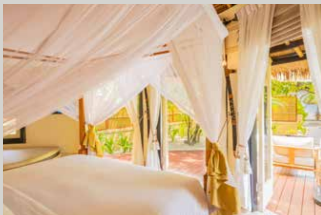
Oceanview Pool Villa (110sqm)