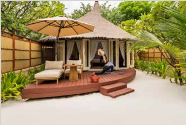
Wellbeing Sanctuary Pool Villa (120sqm)