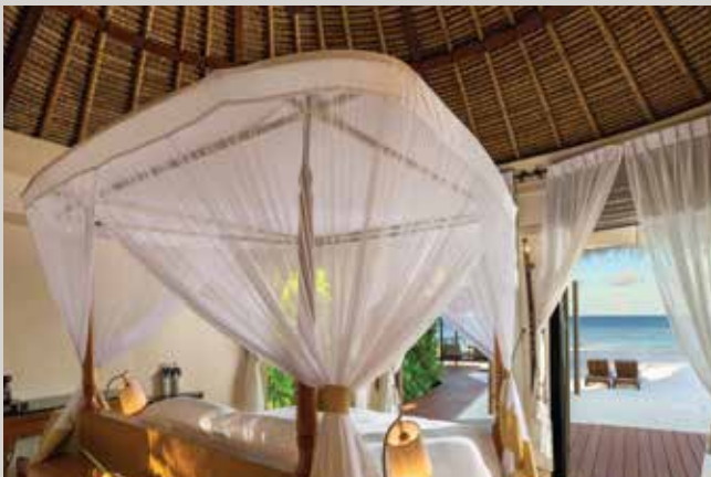
Grand Beachfront Pool Villa (132sqm)