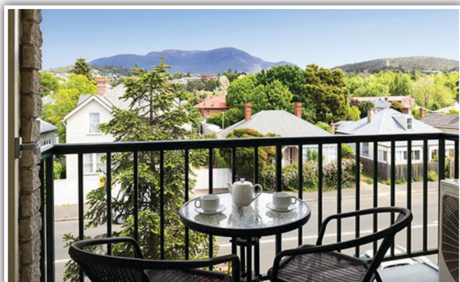
Regent Park Apartments, Hobart TAS

You may bank your entitlement to another external exchange company, however this needs to be advised to Member Services prior to 1st of October and is subject to resort availability.