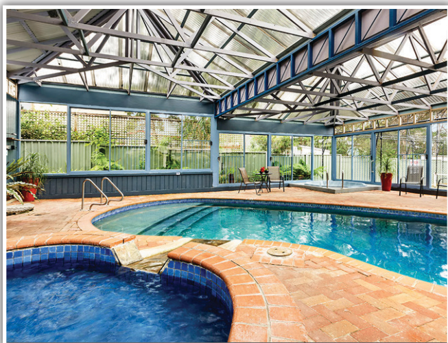
Island Breeze Resort, Cowes VIC

The above cancellation policy applies to Holiday Concepts resorts and may differ with various exchange companies. Always check your confirmation or with Member Services about the cancellation policy for non-Holiday Concepts resorts.