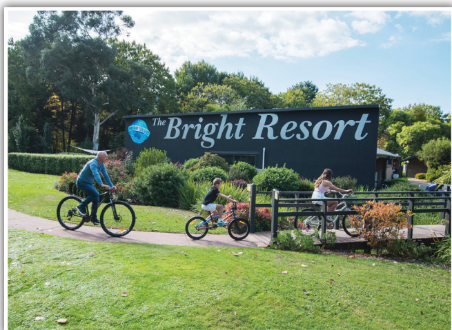
The Bright Resort, Bright VIC

We recommend BPAY and online payments during December and January to avoid waiting times on the phone.