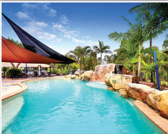
Tamarind Sands Resort, Cabarita Beach NSW

We welcome you to the Holiday Concepts Group and we look forward to giving you opportunities to holiday around Australia and the world.