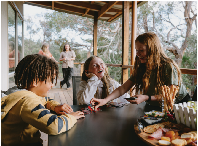
Bellbrae Country Club, Bellbrae VIC

The Holiday Concepts website is an excellent way to keep track of your timeshare. You can make payments, entitlement and Ultimate Escape bookings and update your personal details. Use the secure login section to take advantage of the benefits and convenience of your online account. Simply go to www.holidayconcepts.com.au to get started, or contact Member Services for advice on login access.