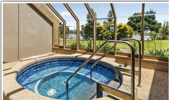
Lakeside Country Club, Numurkah VIC

All Holiday Concepts resorts require a security deposit. Please refer to your confirmation for further details. Confirmation and photo identification must be presented to reception at check-in.