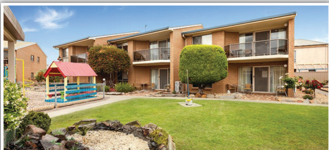
Marine Cove Resort, Goolwa Sth SA

Every timeshare resort has designated check-in days. Whilst all Holiday Concepts resorts have a Friday check in, and some have Thursday and Saturday check-ins, other resorts in Australia and around the world may have a different day. It is always important that any plans are confirmed around the resort's check-in day.