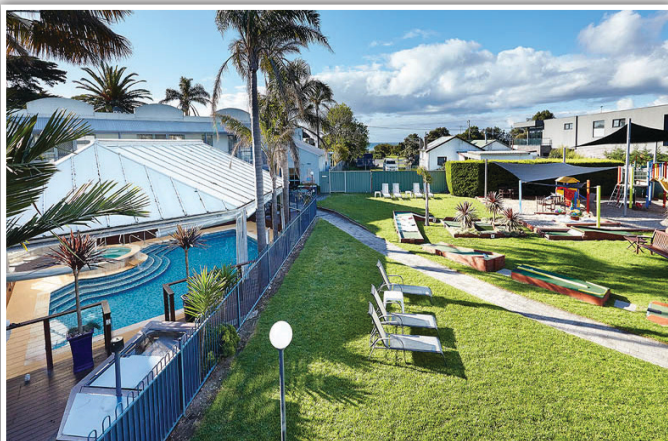
Whitecliffs Beach Resort, Rye VIC

*Exchange fees current at time of print.