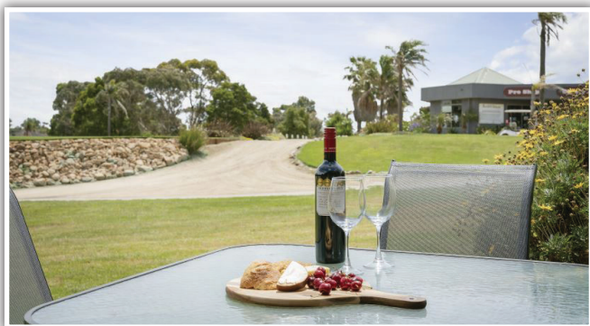
Mt Martha Valley Resort, Safety Beach VIC