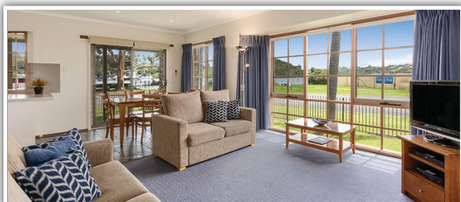
Riviera Beach Resort, Lakes Entrance VIC

A members account must be financially in order to make a booking and to holiday (i.e. this includes banked weeks).