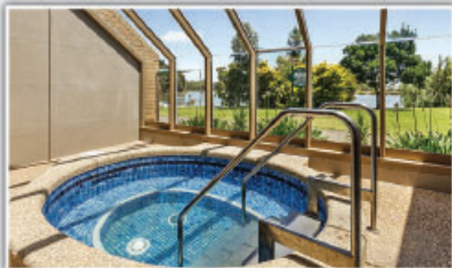
Lakeside Country Club, Numurkah VIC

All Holiday Concepts resorts require a security deposit. Please refer to your confirmation for further details. Confirmation and photo identification must be presented to reception at check-in.