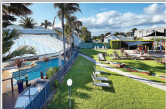
Whitecliffs Beach Resort, Rye VIC

*Exchange fees current at time of print.