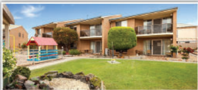
Marine Cove Resort, Goolwa Sth SA

Every timeshare resort has designated check-in days. Whilst all Holiday Concepts resorts have a Friday check in, and some have Thursday and Saturday check-ins, other resorts in Australia and around the world may have a different day. It is always important that any plans are confirmed around the resort's check-in day.