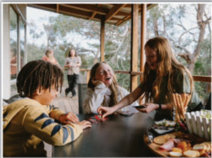
Bellbrae Country Club, Bellbrae VIC

The Holiday Concepts website is an excellent way to keep track of your timeshare. You can make payments, entitlement and Ultimate Escape bookings and update your personal details. Use the secure login section to take advantage of the benefits and convenience of your online account. Simply go to www.holidayconcepts.com.au to get started, or contact Member Services for advice on login access.