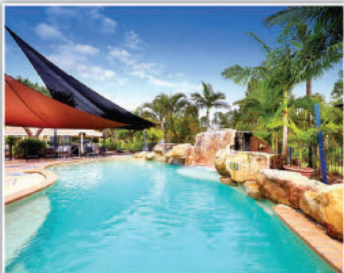
Tamarind Sands Resort, Cabarita Beach NSW

We welcome you to the Holiday Concepts Group and we look forward to giving you opportunities to holiday around Australia and the world.