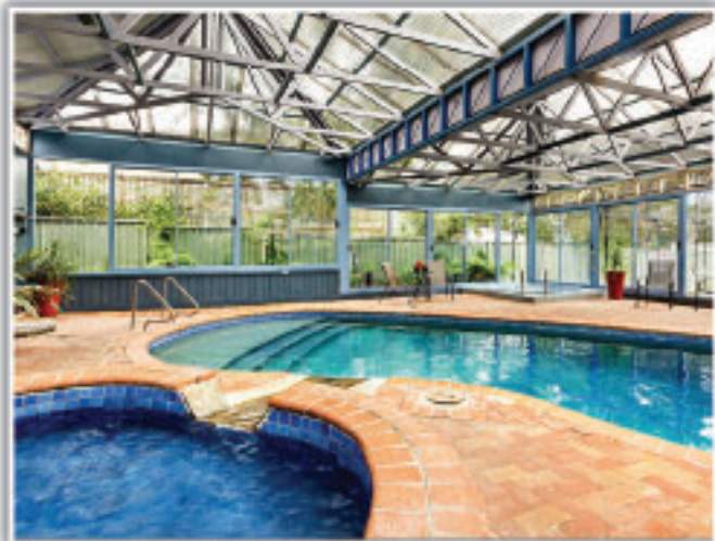
Island Breeze Resort, Cowes VIC

The above cancellation policy applies to Holiday Concepts resorts and may differ with various exchange companies. Always check your confirmation or with Member Services about the cancellation policy for non-Holiday Concepts resorts.