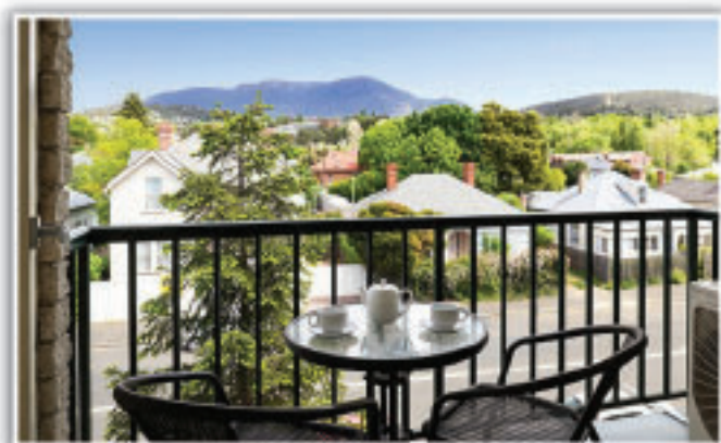
Regent Park Apartments, Hobart TAS

You may bank your entitlement to another external exchange company, however this needs to be advised to Member Services prior to 1st of October and is subject to resort availability.