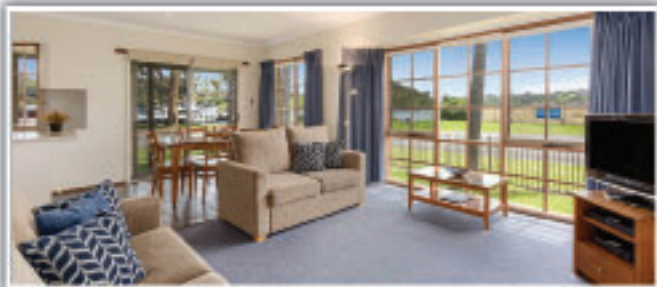
Riviera Beach Resort, Lakes Entrance VIC

A members account must be financially in order to make a booking and to holiday (i.e. this includes banked weeks).