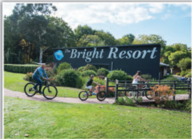
The Bright Resort, Bright VIC

We recommend BPAY and online payments during December and January to avoid waiting times on the phone.