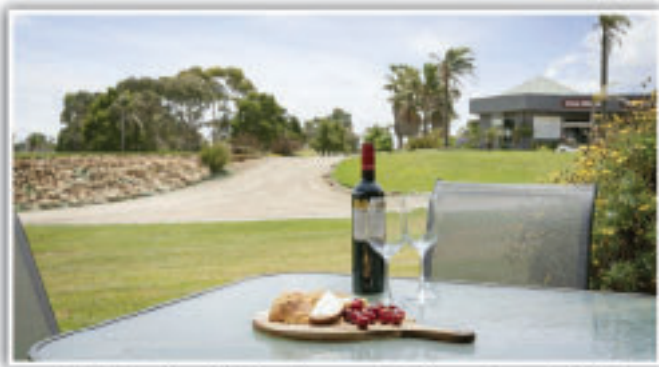
Mt Martha Valley Resort, Safety Beach VIC