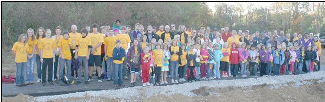
Albin Pond/Safe Routes to School Trail Opened 2010 * 2.3-miles