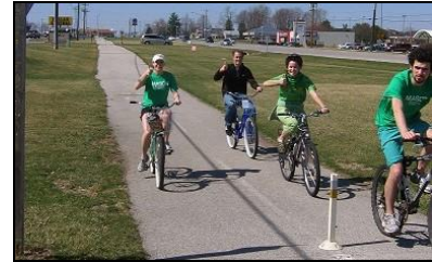
Big Walnut Sports Park Link Trail Opened 2002 * 1.75-miles