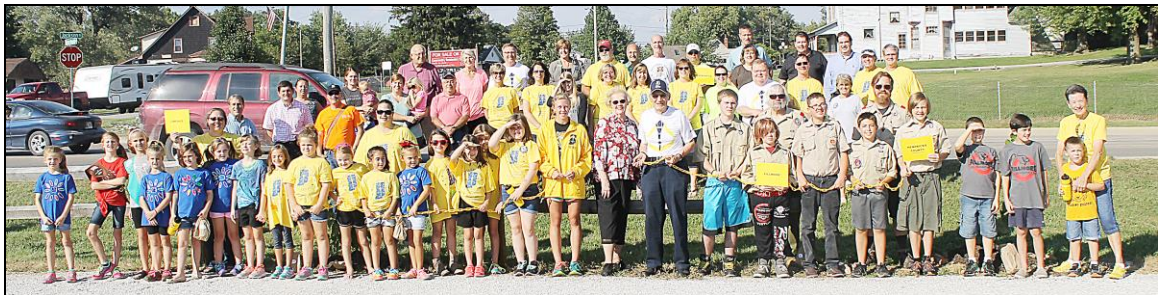
Putnam Nature Trail/Phase 1 Opened 2016 * 0.8-miles