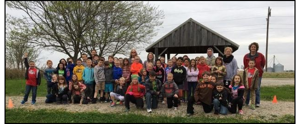
Greencastle/Fillmore Trail Opened 1999 * 3.1-miles