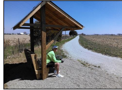
People Pathways/Putnam County Vandalia Trail Completed 2013 * 4.7-miles