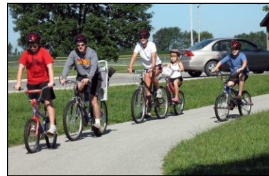
Big Walnut Sports Park Loop Trail Opened 2005 * 1.25miles