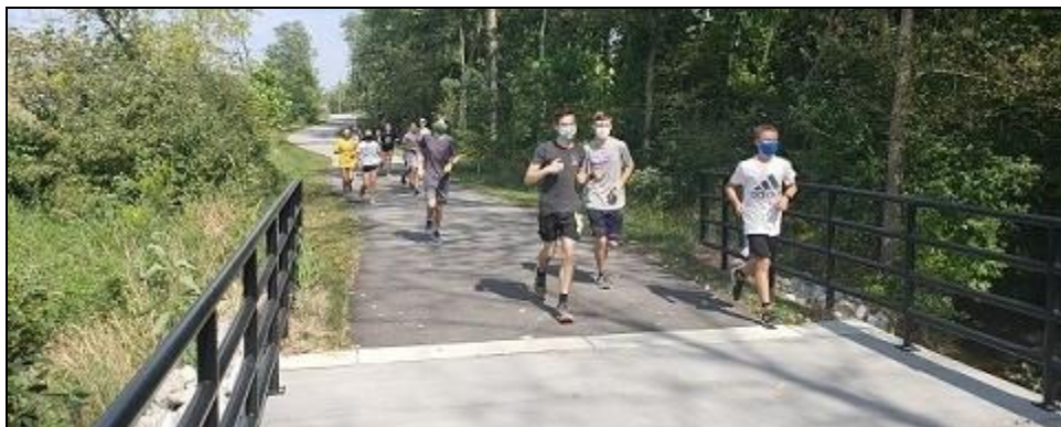
Campus Link Trail/Phase 1 Completed 2020 * 1.2-miles