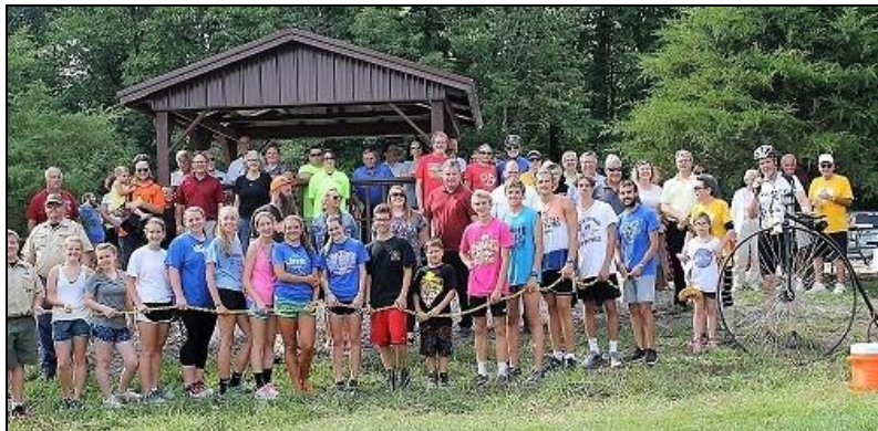
Putnam Nature Trail/Phase 2a & 2b Opened 2018 * 2.60-miles