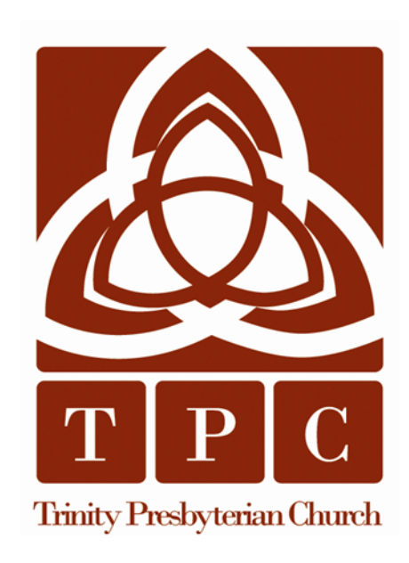
February 4, 2024