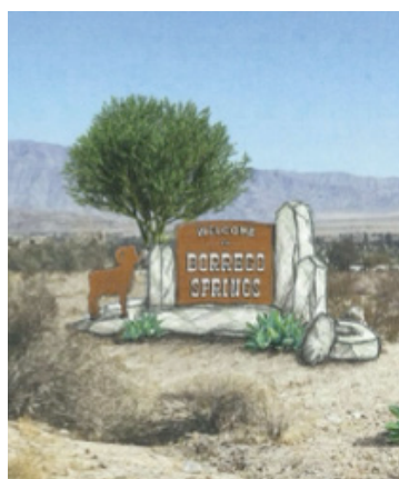
The foot of Montezuma Grade