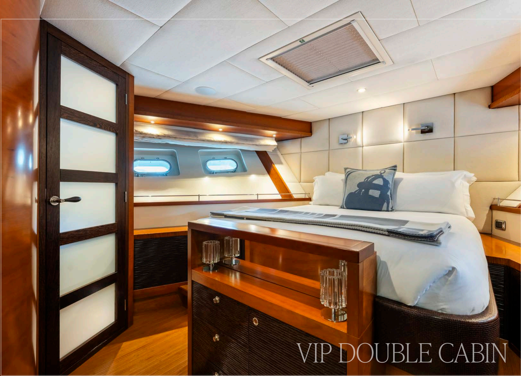
VIP DOUBLE CABIN