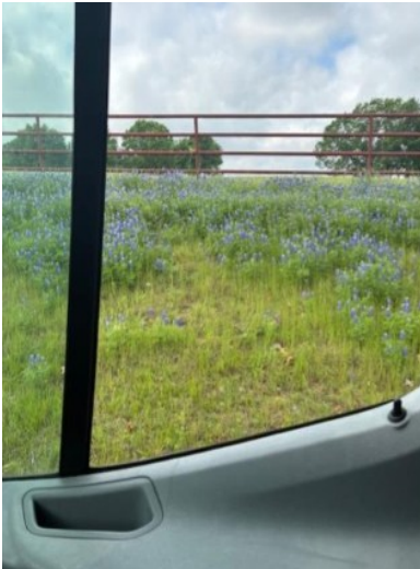
Bluebonnet Trails in Ennis, TX