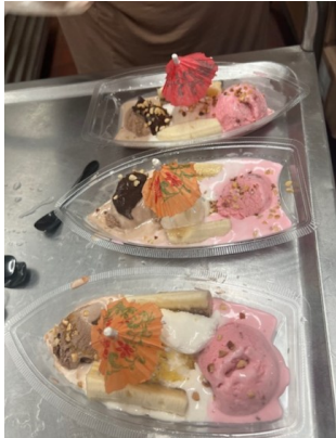
Banana Splits on National Banana Day!