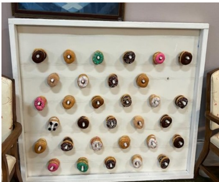
Summit Windows treats residents and staff with a donut wall!