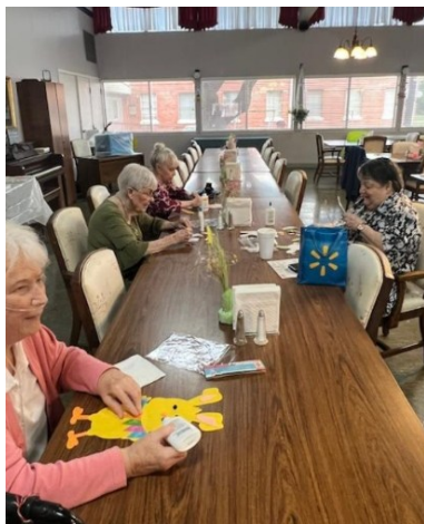
Residents enjoyed doing Easter crafts