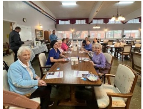
Assisting Hands provides fall prevention information and an ice cream taste test!