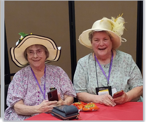
Fun Night — Kentucky Derby Theme