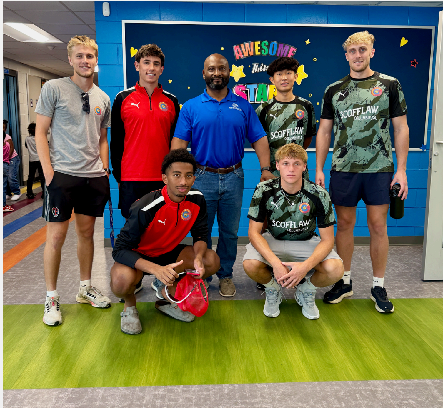
Columbus United Visits our North Columbus Club