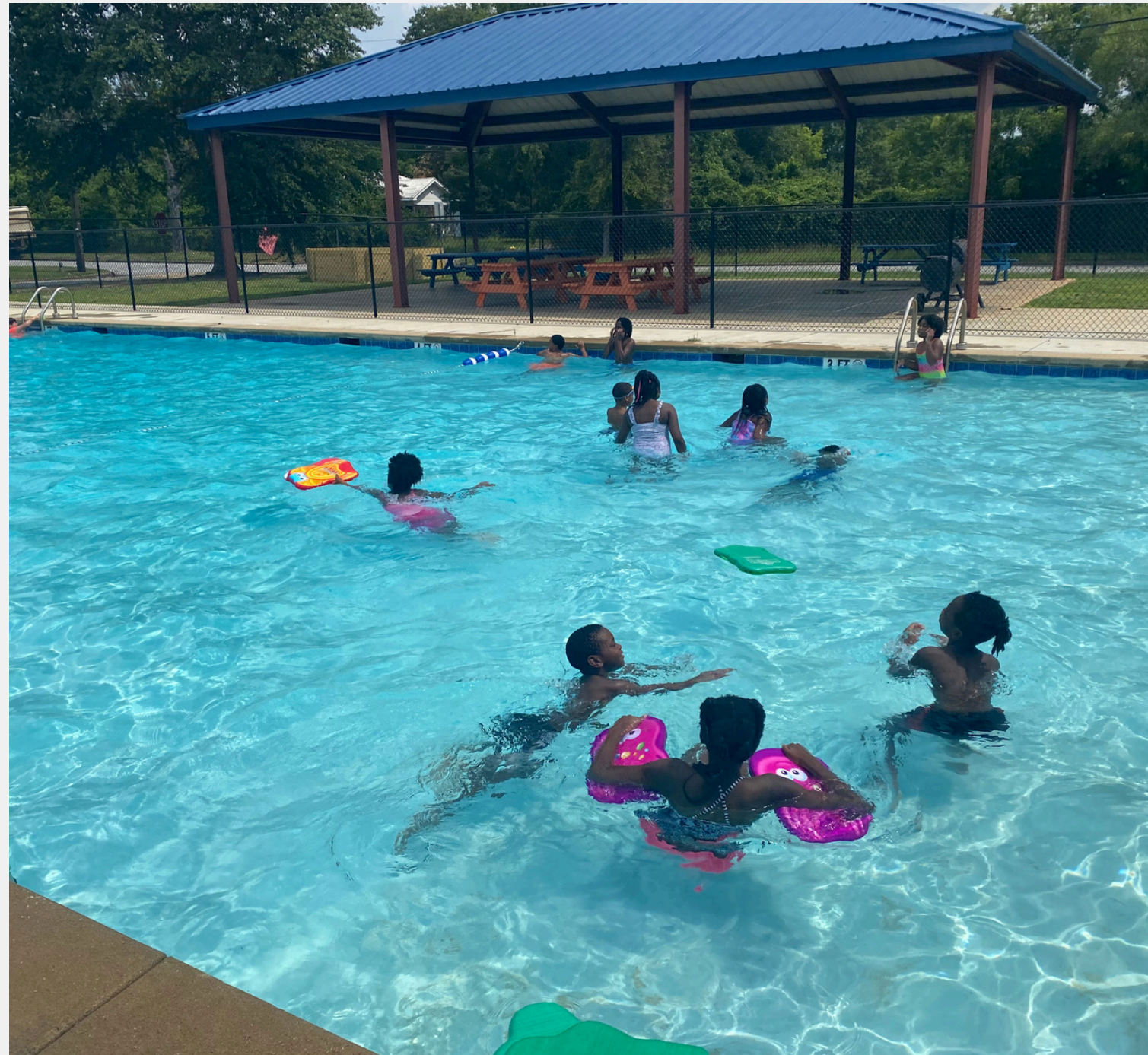
North Columbus Boys & Girls Club