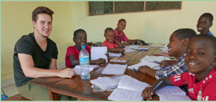
The children and Mamas are extremely grateful for the daily support from the volunteers while doing homework.