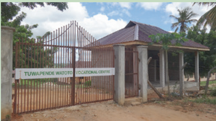
In our vocational shop we will sell goods from the bakery, fruits, vegetables and items from the tailoring workshops to the people of the surroundings.