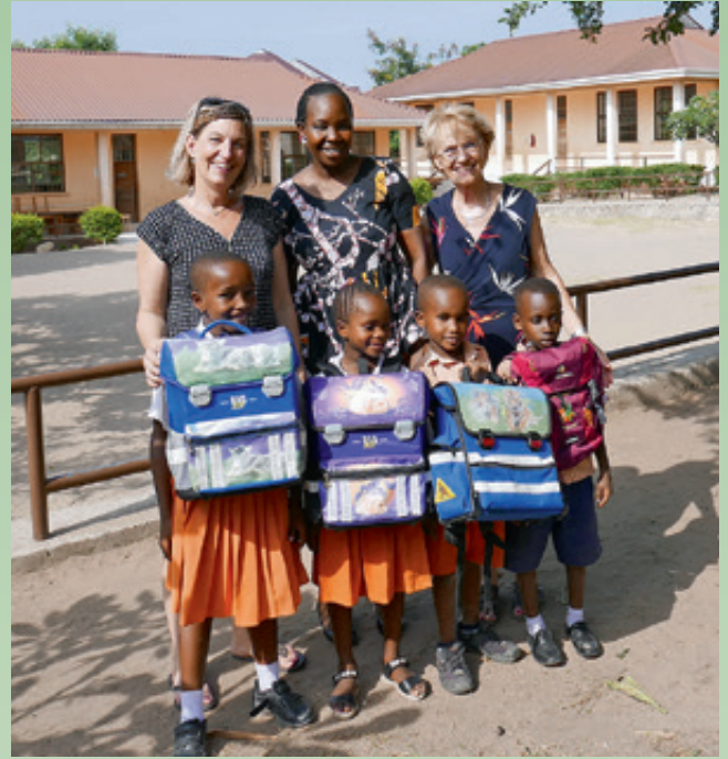
The children of the families in need are very grateful for the schoolbags from Switzerland.