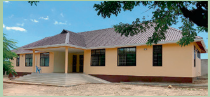
With the new building for the young adults, our children's home area is now equipped with all necessary premises.