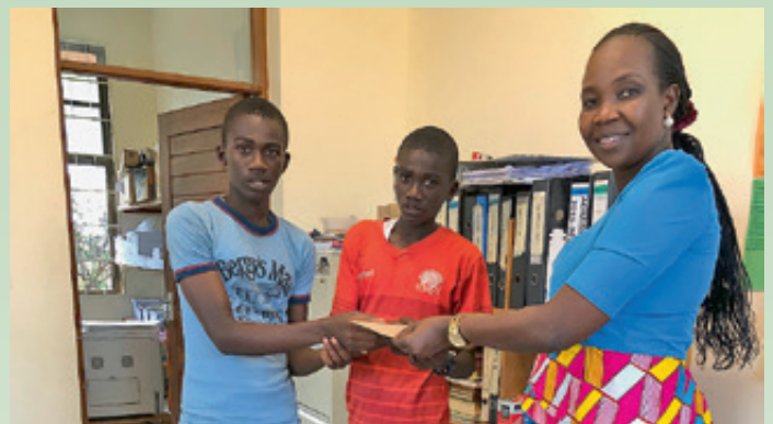
Our head mistress hands over our contribution to the supported primary school graduates.