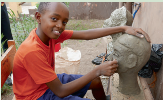
An artist teaches artistic design at our school.