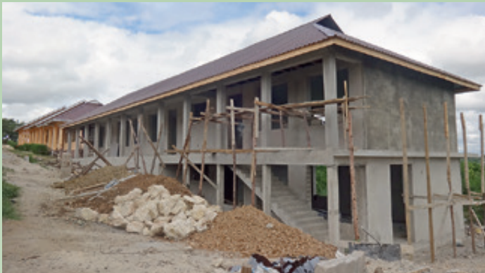
End of May we will be able to move in the fourth building with four classrooms/workshops.