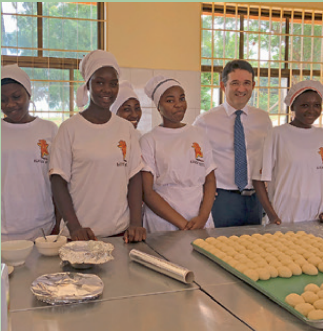
The bakery and food production apprentices proudly present the bread rolls which they prepared for our pupils.