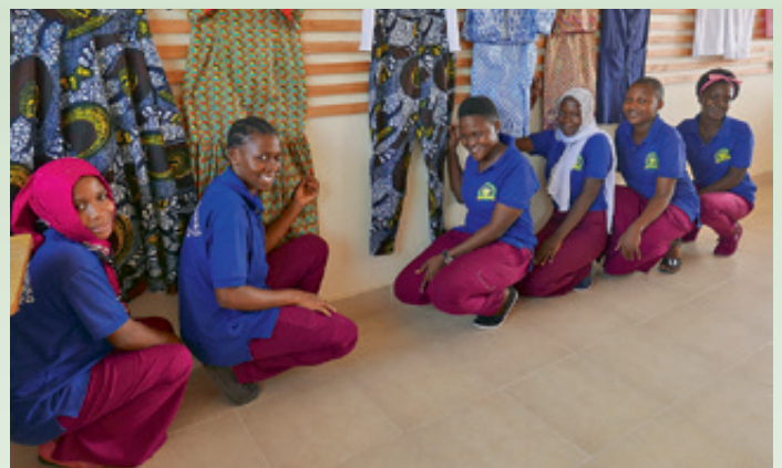
The tailoring apprentices are very happy to present their work.