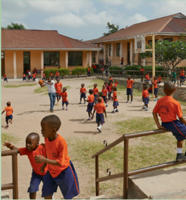
As of January 2019 we are teaching 620 pupils from day care to grade seven.