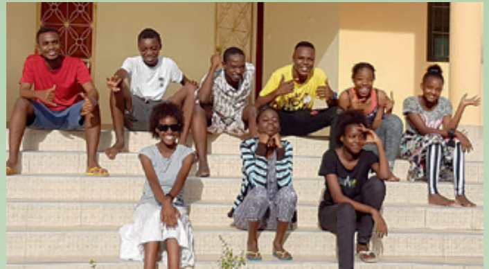
Tuwapende Watoto teenagers and young adults are enjoying the new building and thank all donors.