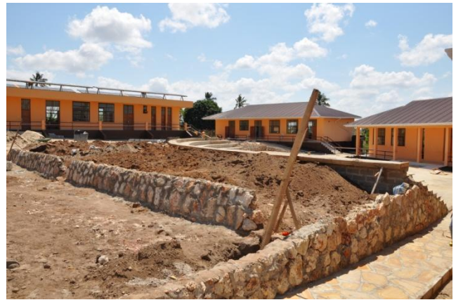
The administration building (left), the kitchen/ dining hall (middle) and a classroom block (right)