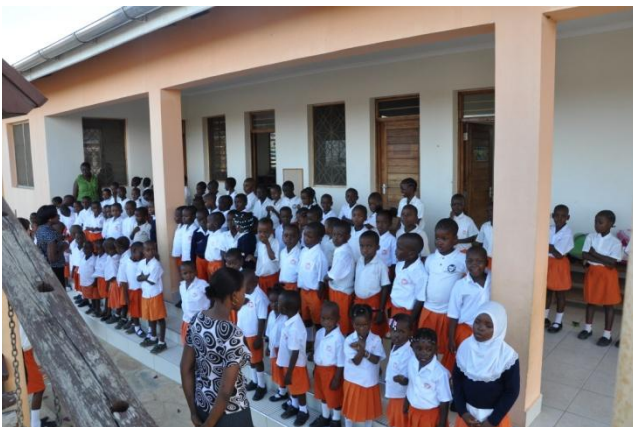
Morning assembly at the Tuwapende Watoto School