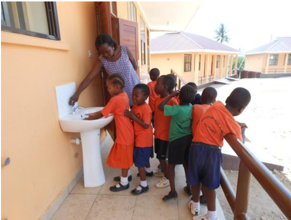
Washing hands before lunch