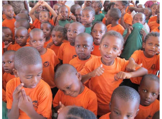
During a rehearsal for parents' day