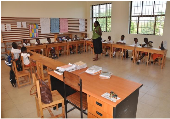
Class in a new classroom block