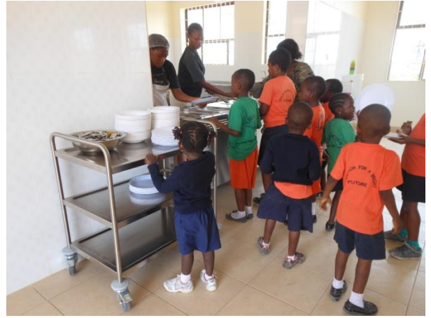
Pupils waiting for their lunch