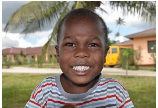
Baraka also joined the Tuwapende Watoto family in 2012