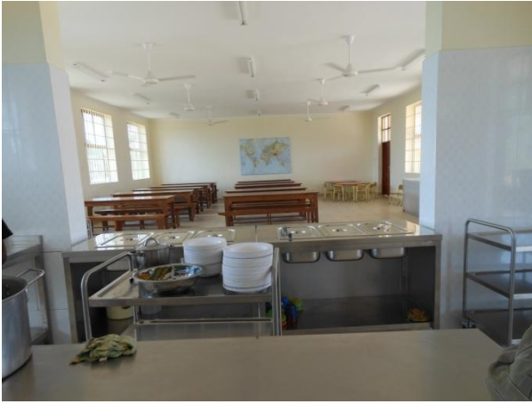
View from the new school kitchen to the dining hall