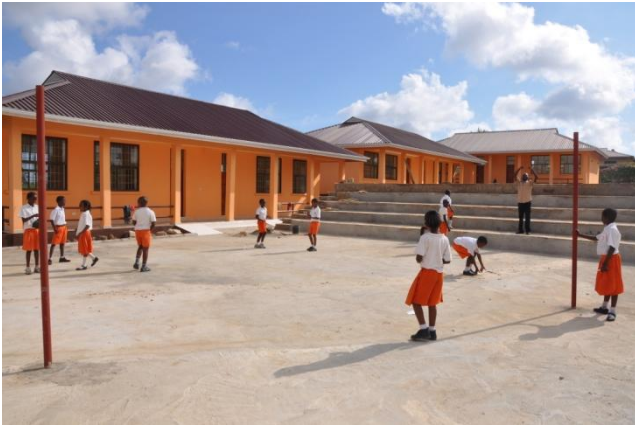
The three new classroom blocks