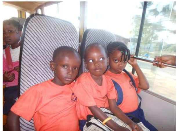
On the way to school in the Tuwapende Watoto school bus