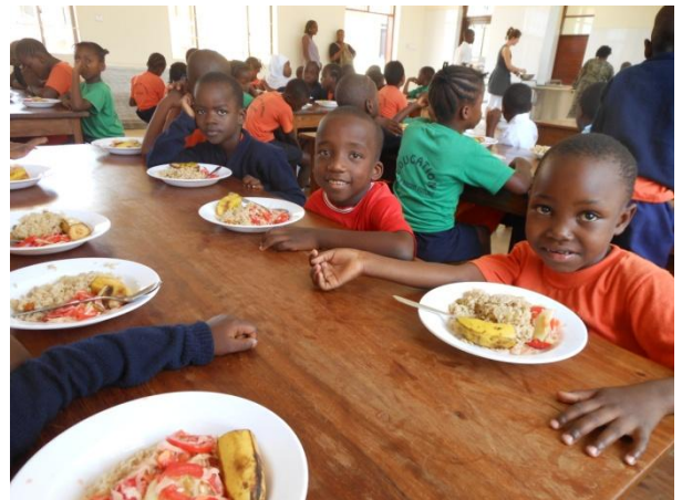
Lunch in the new dining hall