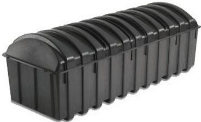
$995 POLYPROPYLENE GRAVE BOX MINIMUM PROTECTION NOT LINED OR SEALED

Saturday Service Charge $400 Sunday Service Charge $600 No Holiday Deliveries