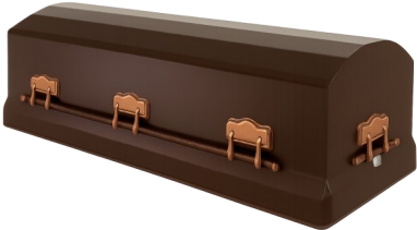
$2,595 12 GA. STEEL GALVANIZED POWER COAT FINISH STANDARD PROTECTION