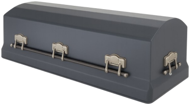
$2,395 12 GA. STEEL POWER COAT FINISH STANDARD PROTECTION