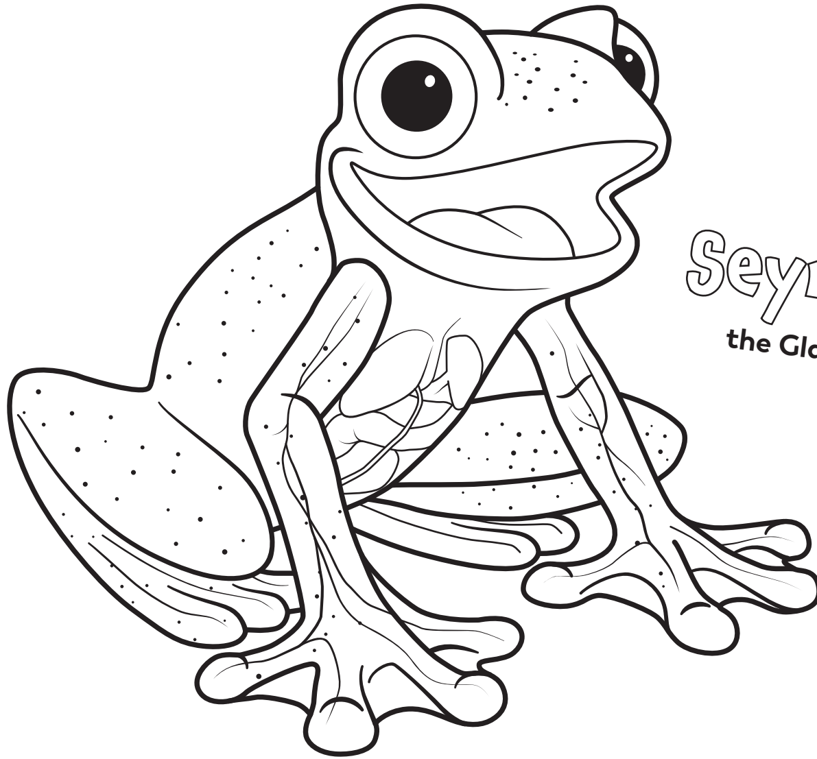
Seymour the Glass Frog

“O Lord, you have examined my heart and know everything about me.”