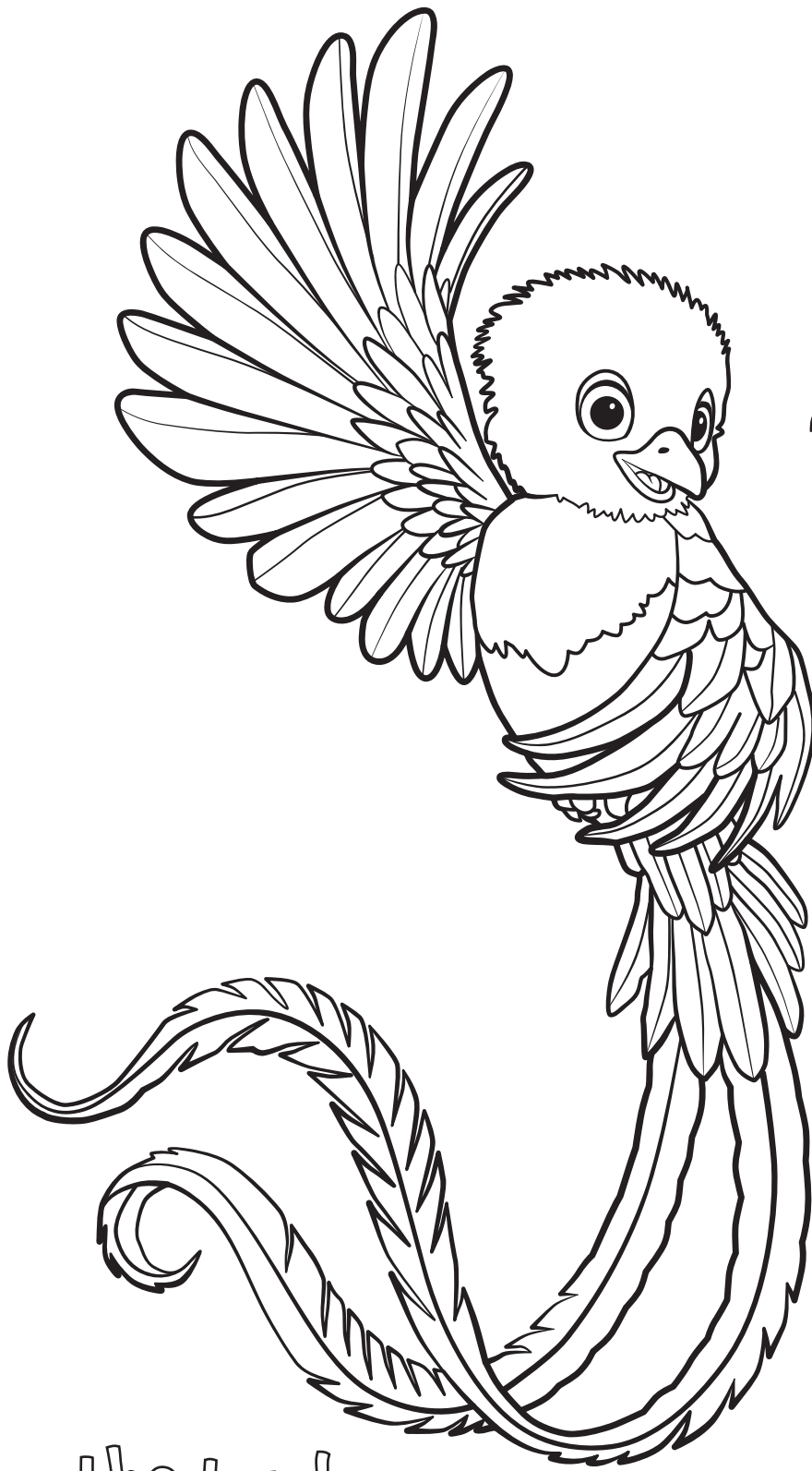
Tango the Quetzal

“praise the Lord, everything he has created, everything in all his kingdom.”