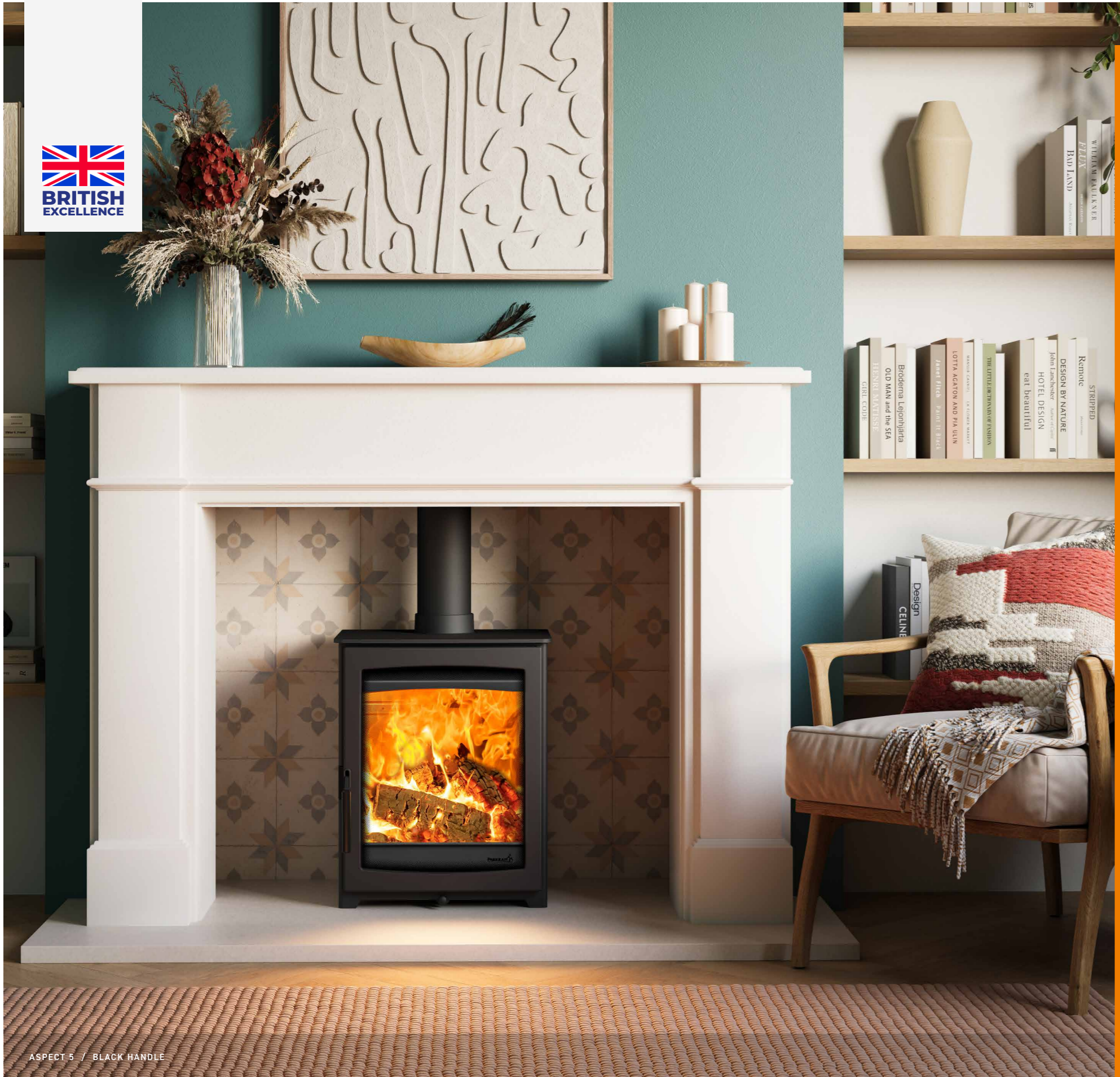
ASPECT 5 / BLACK HANDLE