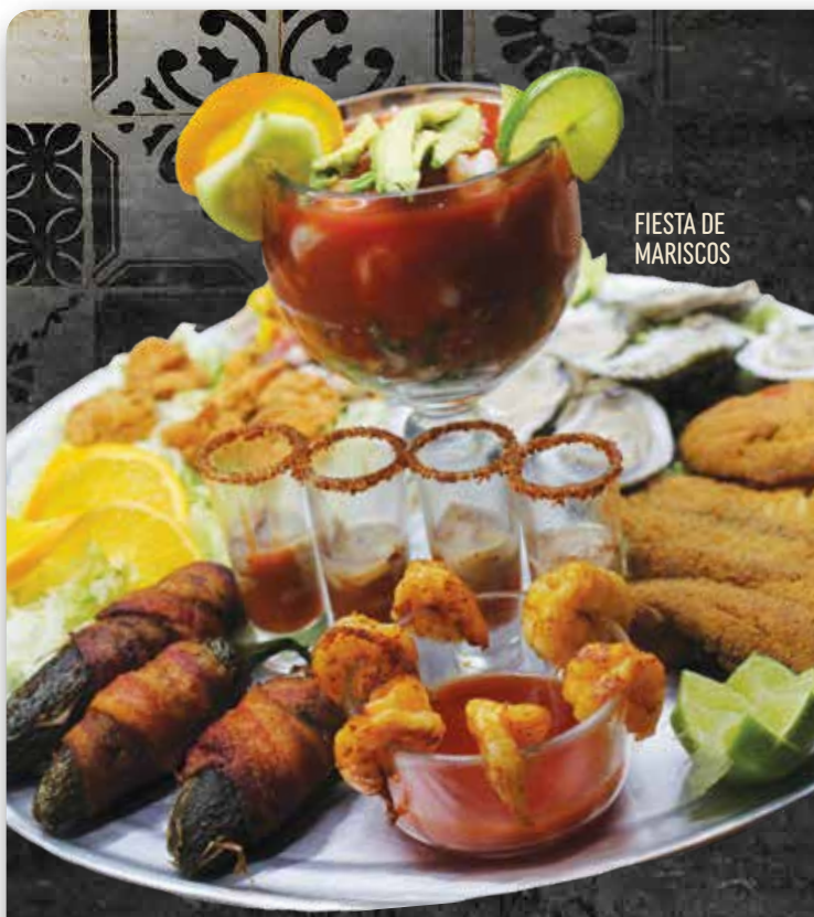
FIESTA DE MARISCOS