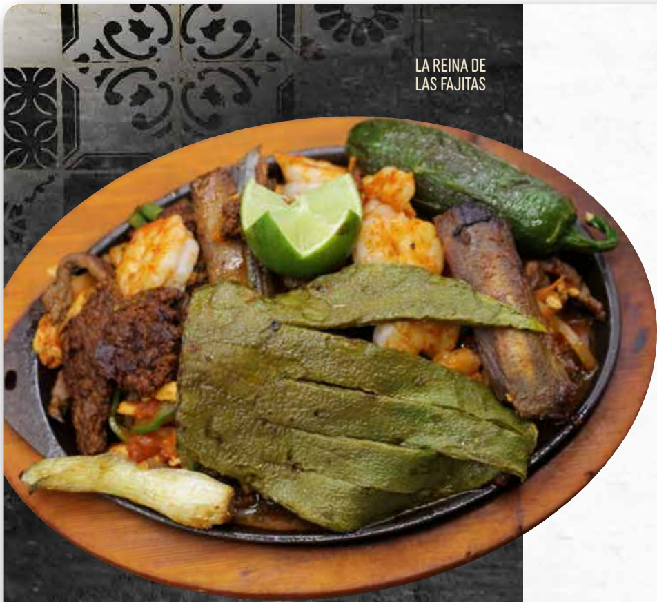
LA REINA DE LAS FAJITAS