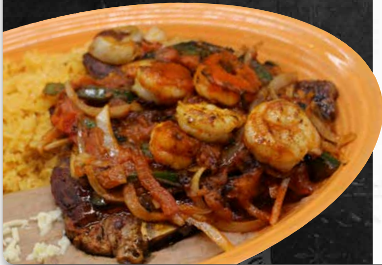
MAR Y TIERRA

Bean choices: Refried, Black or Charro Beans