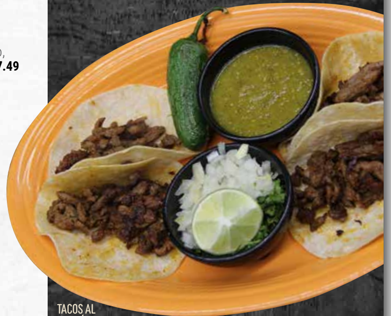
TACOS AL CARBÓN