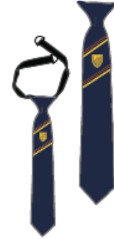
School Ties Navy Clip-on & Elastic - 48"