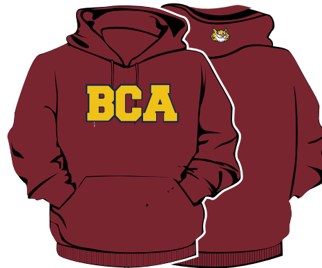
Unisex Hoodie Maroon