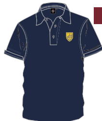
Unisex Polo Navy