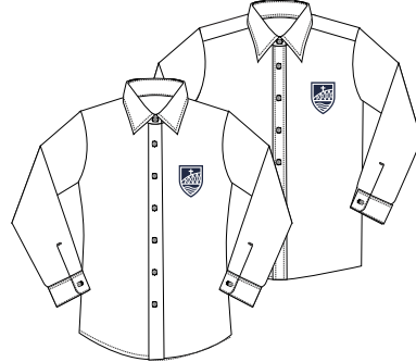
Girls Oxford Shirt L/S 2pk white