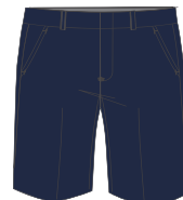
Unisex Casual Short Navy