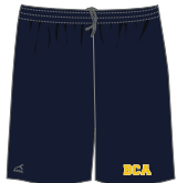
Unisex Short Dri-Fit Navy