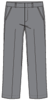
Unisex Dress Pant Grey