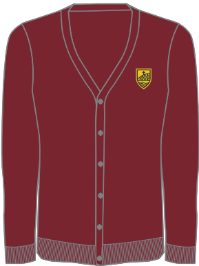
Girls Cardigan Maroon