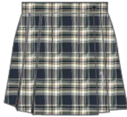
Girls Kilt Tartan