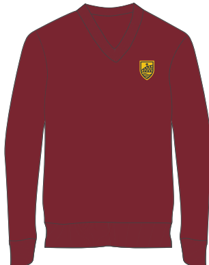
Unisex V-Neck Sweater Maroon