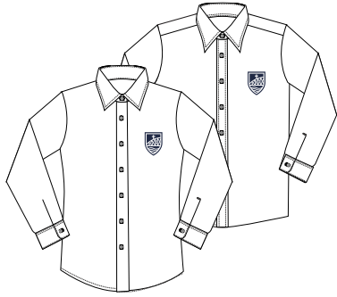
Unisex Oxford Shirt L/S 2pk white