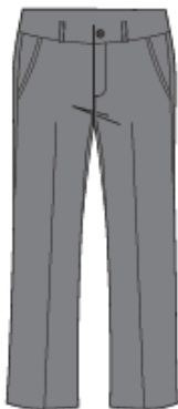
Girls Dress Pant Grey