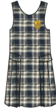
Girls Tunic Tartan