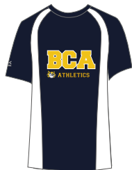
Unisex T-Shirt Dri-Fit Navy