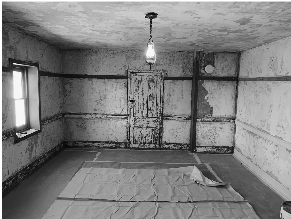
Chair exhibit room under restoration