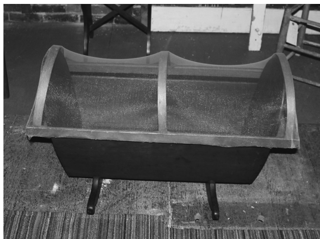
Cradle and cover