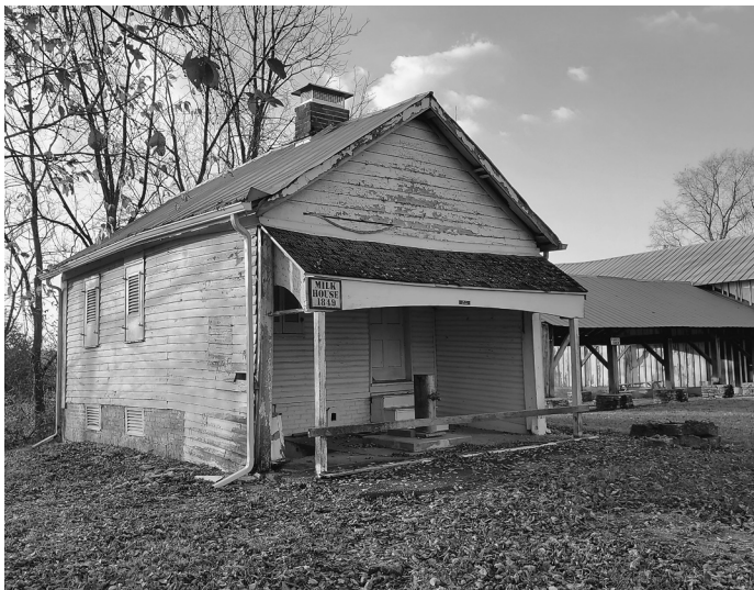
The North Family Milk House awaiting the start of restoration now that funds have been raised. See page 3 for details.