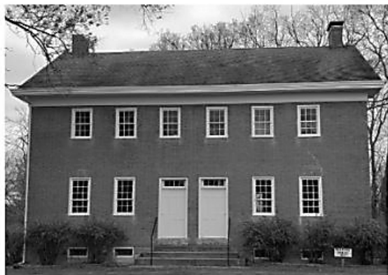
Celebrating 200 years