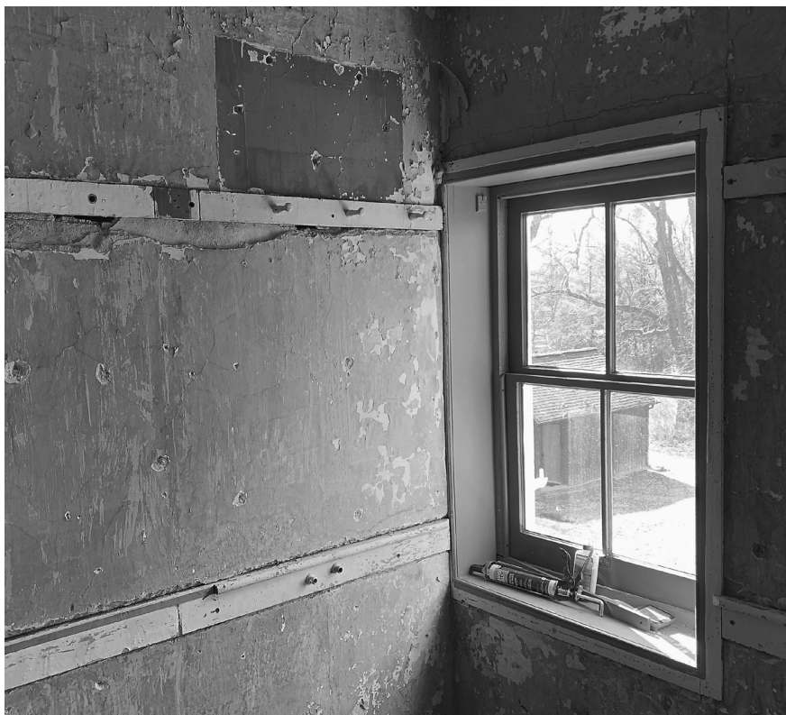
West end of second floor hallway under restoration

Prior to painting, there will be jobs such as securing drop cloths/floor protection, patching holes in halls, sanding, and taping windows to prep for painting. Currently, work is scheduled for the following dates: March 3, 4 and 5; March 11, 12 and 13; and March 17, 18 and 19. Volunteers are welcome to contact us at <friendsofwwsv@gmail.com> to sign up for a work day (or two) to help make this project a success.