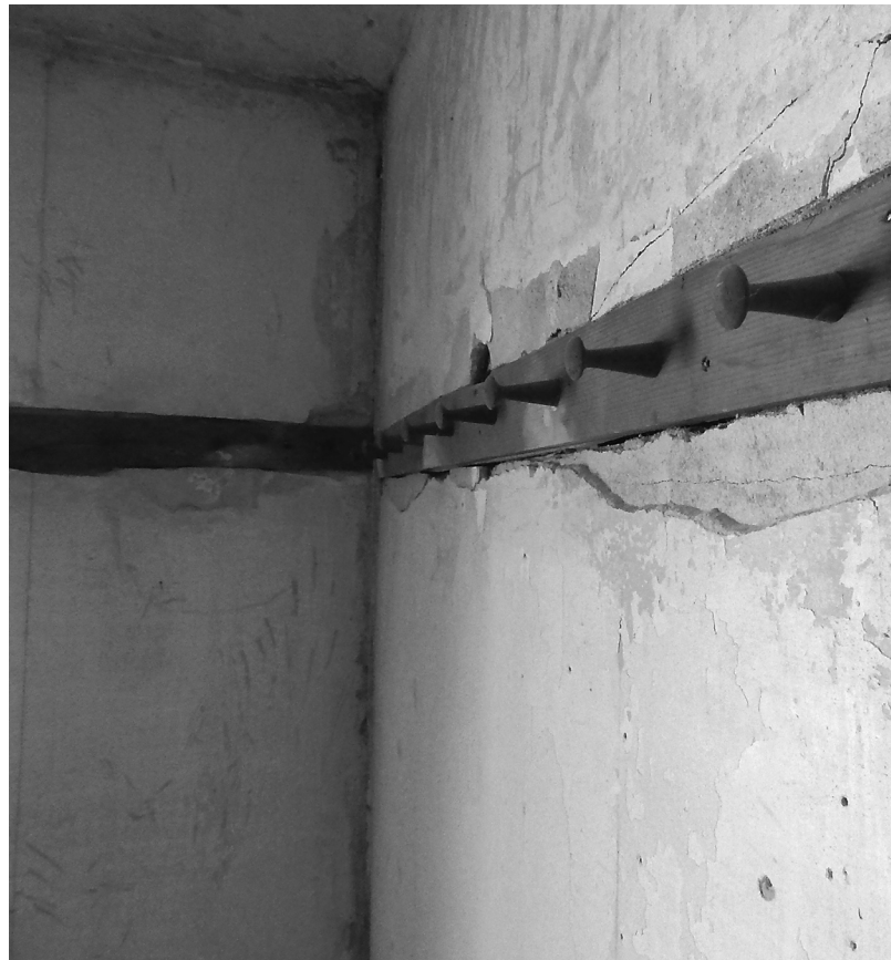
Peg rail donated by Warren County Historical Society