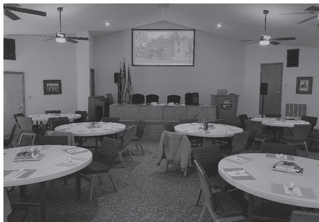
The last Annual Gathering

related items. Please send an email to susybskt@cinci.rr.com describing your donated item by Monday March 30.