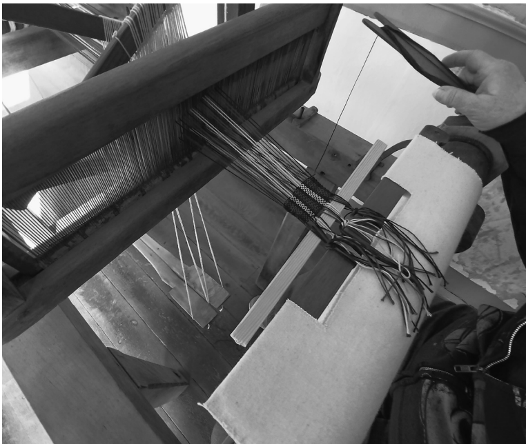
Weaving on the loom