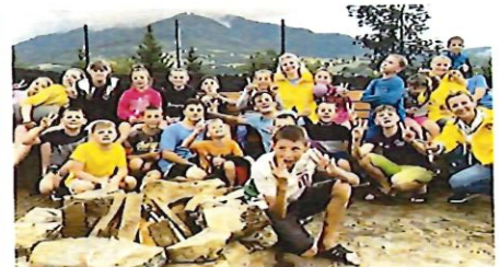
Fig. 3: Kids at Miracles Center

*Donating is not a requirement to attend VBS.