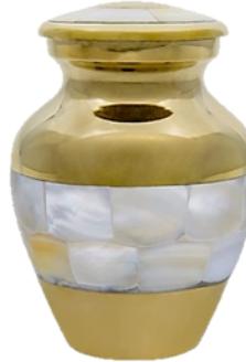
Mother of Pearl