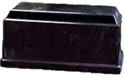
Cultured Marble Companion