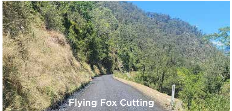
Flying Fox Cutting