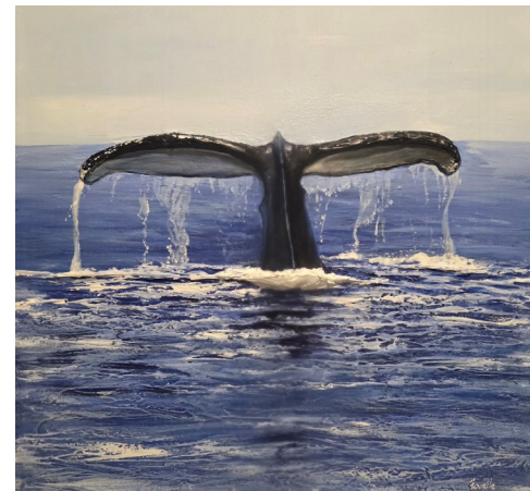
Whale's Tale by Fanelle White

Reception: Friday, August 14, 2026 7:00 - 8:30pm