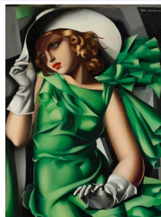
Young Lady with Gloves by Tamara de Lempicka