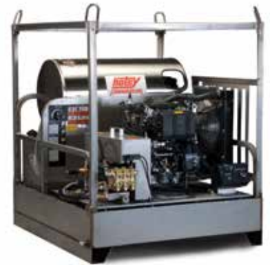
Shown with stainless steel cage option H-551, H-553