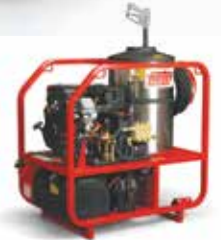
1080BE (shown with optional stainless steel coil wrap and skid rails)