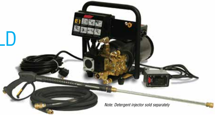
Note: Detergent injector sold separately

The ET Series is the handheld model of the electric-powered line, delivering cleaning capability up to 1400 PSI. All models are ETL safety certified and feature the Hotsy pump backed by a full 7-year limited warranty. All models come equipped with a 50' high-pressure hose, lance, nozzles and trigger gun.