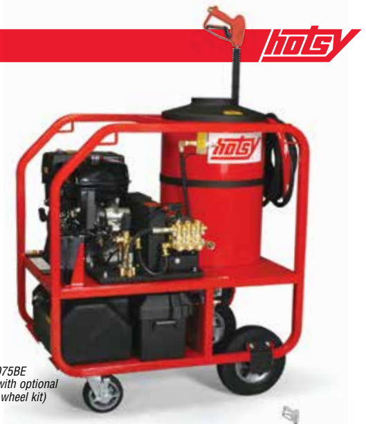
1075BE (shown with optional caster wheel kit)

The belt drive versions of the Gas Engine Series provide versatility with the roll cage design. Designed to fit the needs of the end-user, this versatile hot water washer converts easily to a skid unit, portable with wheels or a wheel/caster kit, or can be mounted on a trailer. Powered by reliable gasoline engines, the four models offer a broad range of cleaning power, from 4.0 to 4.6 GPM and from 3500 PSI. All models are ETL safety certified and feature the Hotsy pump backed by a full 7-year limited warranty. All models come equipped with a 50' high-pressure hose, lance, nozzles and trigger gun.