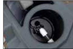
Reliable 120V Transfer Pump capable of transferring 30 GPM of water to the holding tank

Stop wash water from flowing down a drain or away from your area by collecting the wastewater from pressure washing. As EPA laws become more prevalent and strive to conserve water quality, contract cleaners and construction sites will need to recover their wash water and runoff. Eliminate the problem with the RC Series that is capable of recovering and transferring up to 30 GPM of water and transferring to a holding tank. Its small footprint allows the RC Series to be mounted on a trailer. Be fully in control of water flow with the optional water dikes and drain covers to stop water from flowing down a drain or away from your site. Comes standard with a 50' vacuum hose and scupper head.