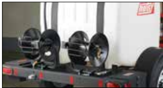
Optional Hose Reel and Mouting Kit