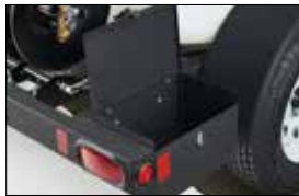
Side Saddle Tool Box