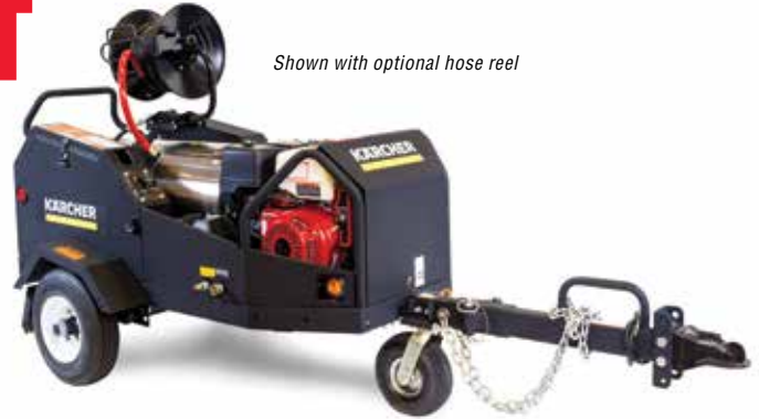
Shown with optional hose reel

Ready to pick up and go at a moments notice, Kärcher's Tule Series HDS 3.5/40 Ge MT hot water pressure washer trailer provides the necessary cleaning power on virtually any job site which has a water source. Simply unhitch the Tule Series HDS 3.5/40 Ge MT and take the cleaning power where you need it most. The Tule Series trailer features a reliable Honda or Vanguard engine, 8 gallon diesel fuel tank, electric start with manual start backup and much more. U.S. Design Patent No. 9,724,734 B2