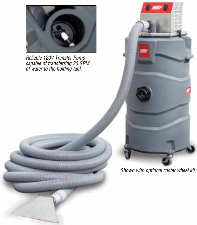
Shown with optional caster wheel kit