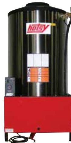
5700 Series Coil-Only Assembly

*Verify voltage on order Contact Specials Dept. for details. Expect extended lead times.