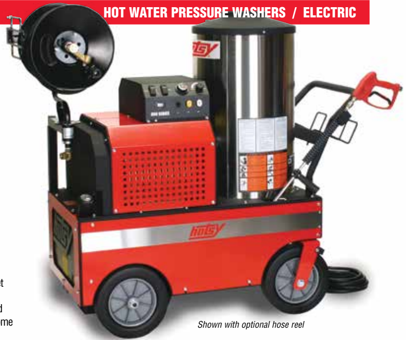
Shown with optional hose reel

Rugged design, easy maneuverability and massive cleaning power. Comparable to the cleaning power of Hotsy's heavy-duty stationary units, the big and beefy 800 Series is surprisingly easy to maneuver into place, allowing you to tackle the heaviest of industrial cleaning jobs. The 28" wide wheel base helps with stability, yet is narrow enough to fit easily through doorways. Components are protected by an easy-to-remove cover allowing servicing access. All models are ETL safety certified and feature the Hotsy pump backed by a full 7-year limited warranty. All models come equipped with a 50' high-pressure hose, lance, nozzles and trigger gun.