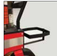
Optional Detergent Bucket Bracket