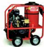
965B (shown with optional flat-free tires)