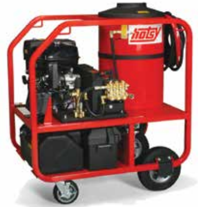
1075BE (shown with optional caster wheel kit)