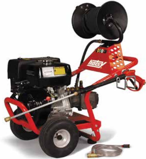
Shown with optional hose reel & mounting kit

The DB Series is the most compact, affordable alternative in the cold water line featuring a direct-drive triplex pump. All models are powered by reliable Honda engines. Lightweight design and tubed pneumatic tires make for easy maneuvering. All models are ETL safety certified and feature the Hotsy pump backed by a full 7-year limited warranty. All models come equipped with a 50' high-pressure hose, lance, trigger gun, nozzles and chemical injector.