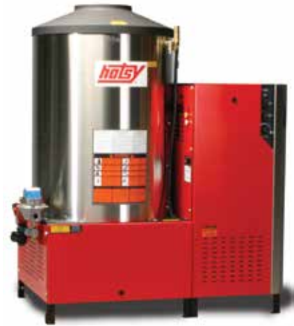
Shown with modulating gas valve

*Contact Specials Dept. for details. Expect extended lead times. Up to 750,000 BTUs. For higher rating, contact our Specials Dept. The two stage gas valve includes two thermostat controller and a gas valve with a high and low gas flow ability.