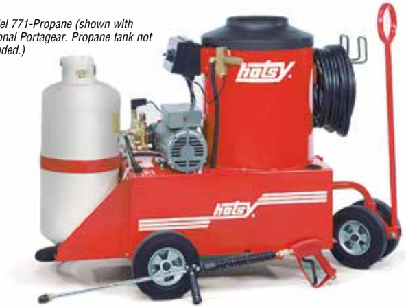
Model 771-Propane (shown with optional Portagear. Propane tank not included.)