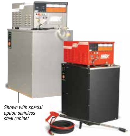
Shown with special option stainless steel cabinet

*Exterior cabinet only † Indicates ETL certified