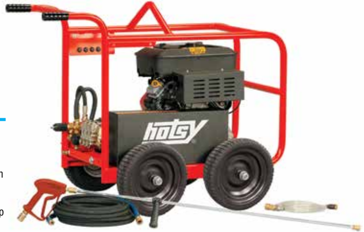
BD Series shown in large cage (4-wheel) version. Small cage 2-wheel version also available.

The BD Series is the most rugged cold water pressure washer on the market with its all-steel frame and cage, Hotsy belt-drive, triplex pump and cleaning power of up to 5000 PSI. Four gas models make up what is Hotsy's most durable cold water line-up ever. All models are ETL safety certified and feature the Hotsy pump backed by a full 7-year limited warranty. All models come equipped with a 50' high-pressure hose, lance, trigger gun, nozzles and chemical injector.