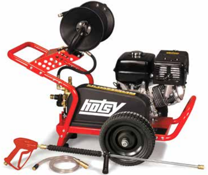
Shown with optional hose reel & mounting kit

The BX Series is similarly rugged to the BD Series, but more compact. Powered by Honda engines, the BX series delivers cleaning power up to 3500 PSI and an all-steel frame protected by a durable powder coat finish. All models are ETL safety certified and feature the Hotsy pump backed by a full 7-year limited warranty. All models come equipped with a 50' high-pressure hose, lance, nozzles and trigger gun.