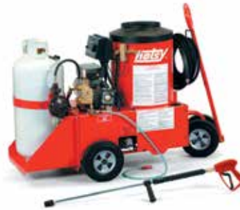
Model 558-Propane (shown with optional Portagear. Propane tank not included.)

These hot water washers are heated with either LP or NG, and offer cleaning power up to 1500 PSI. All models are ETL safety certified and feature the Hotsy pump backed by a full 7-year limited warranty. All models come equipped with a 50' high-pressure hose, lance, nozzles and trigger gun.