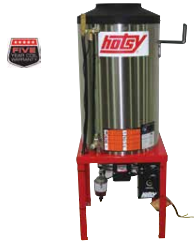
1200 Series Coil-Only Assembly