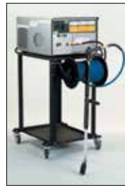
1700 Series shown with optional hose reel kit (PN 8.903-039.0) and Tall Floor Stand (PN 9.801-034.0).