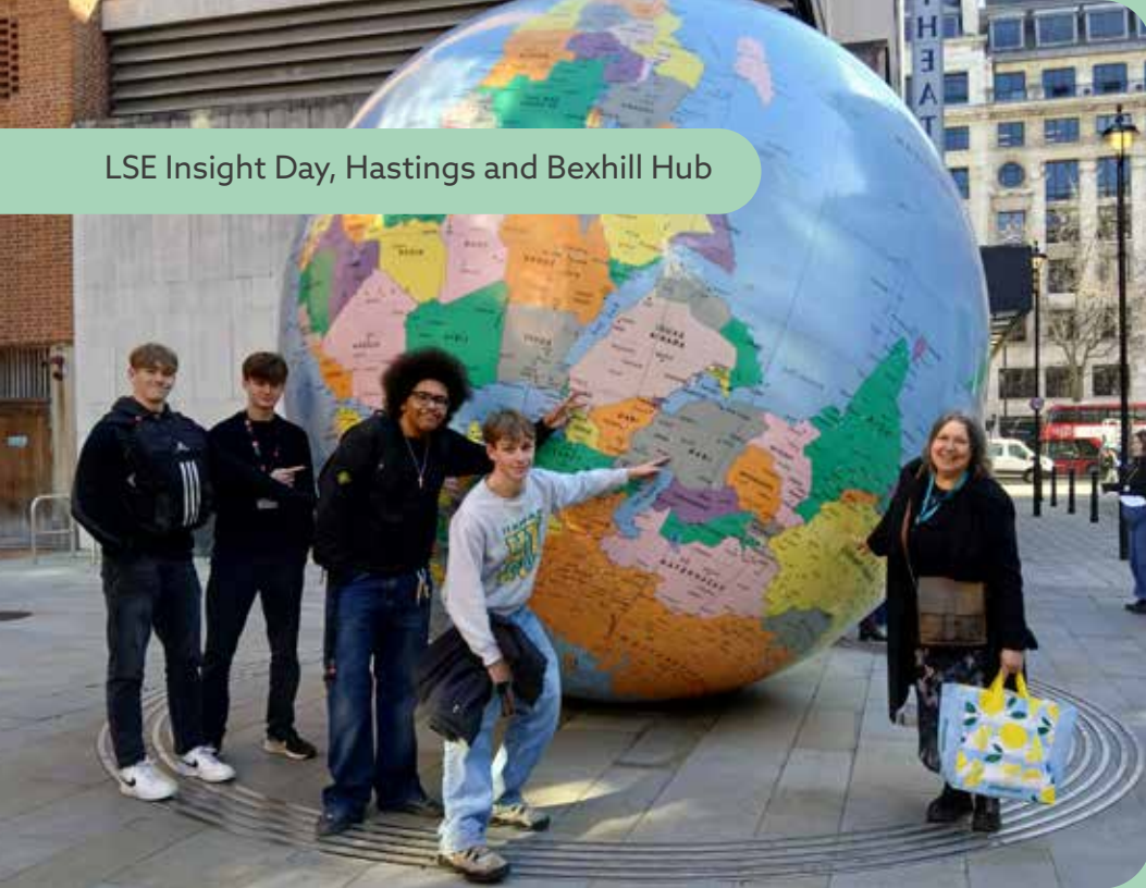
LSE Insight Day, Hastings and Bexhill Hub