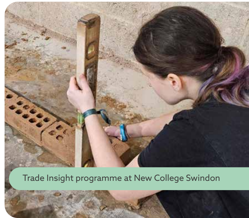
Trade Insight programme at New College Swindon