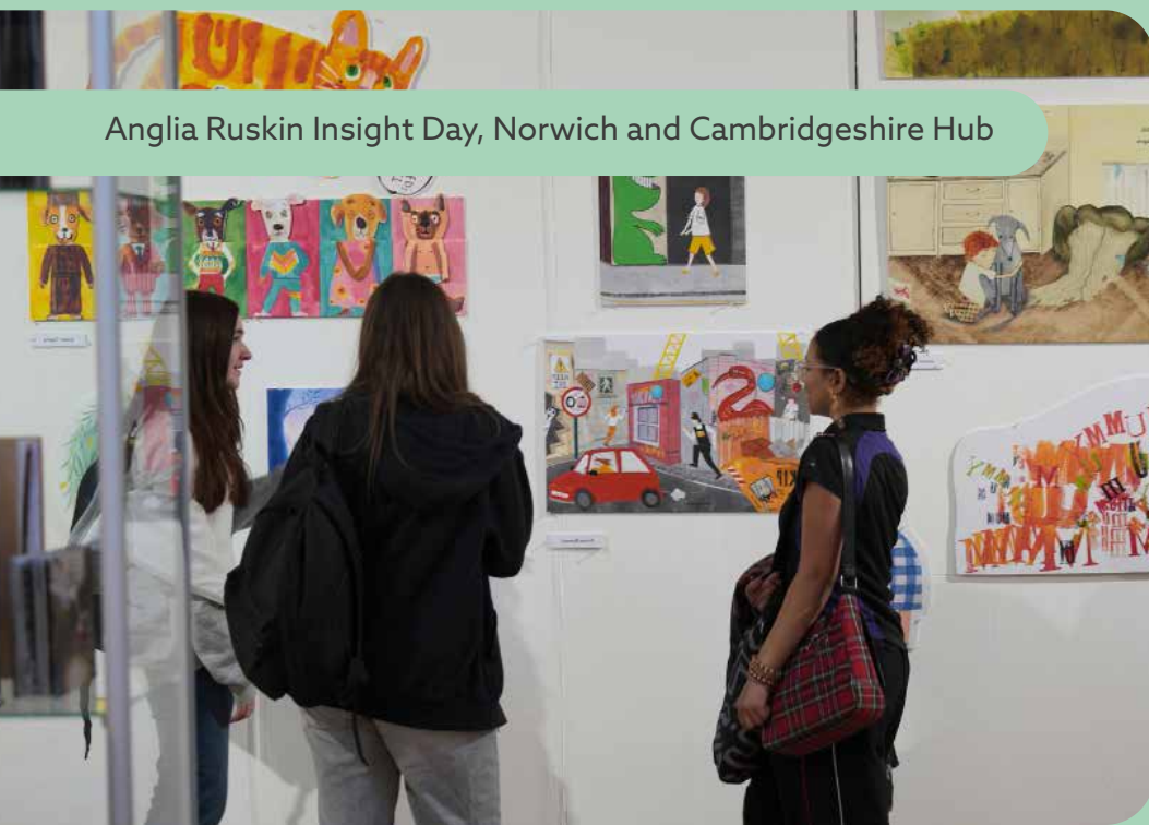
Anglia Ruskin Insight Day, Norwich and Cambridgeshire Hub

“It was an amazing experience to be part of the Villiers Park coaching programme and having continuous support with my early entry applications.”