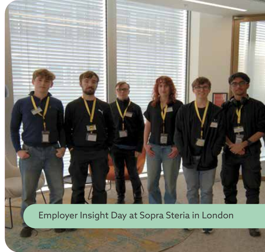
Employer Insight Day at Sopra Steria in London