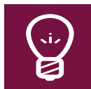
Innovation and Online Tools