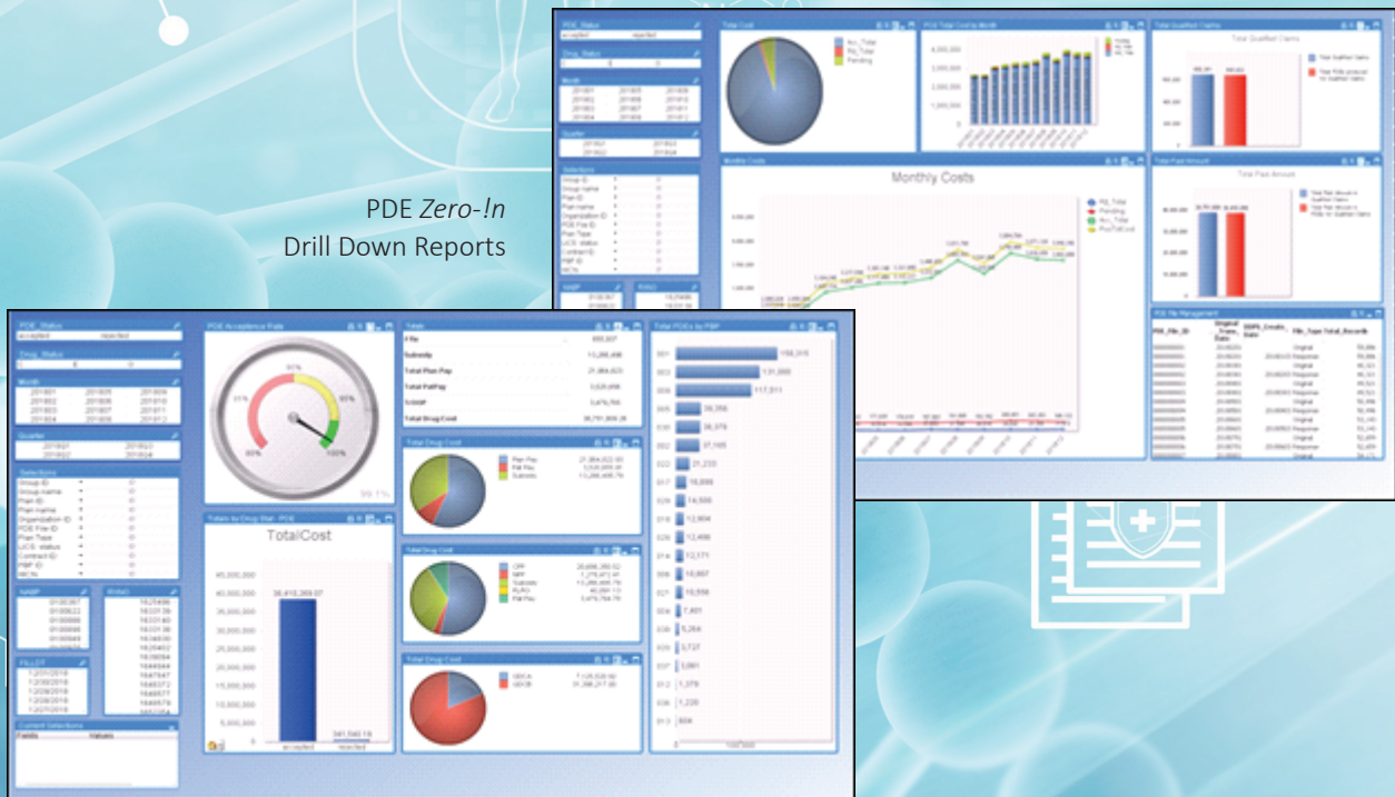
PDE Zero-In Drill Down Reports