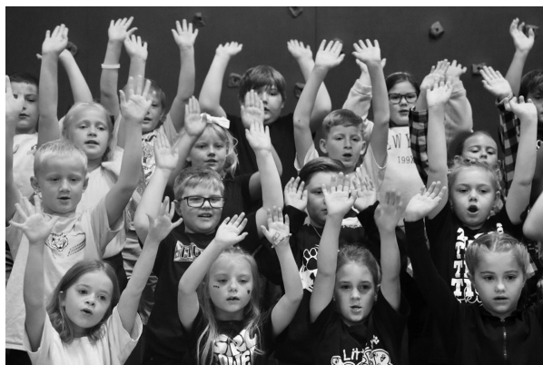
These Skyline students showcased their talents during the Future Alumni performances over Homecoming weekend. All of the elementary students performed with heart and enthusiasm, and later enjoyed a meal at the Community Breakfast.