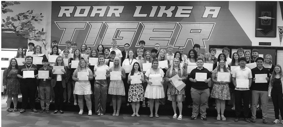
Recipients of Sedalia School District Foundation scholarships at Senior Awards Night on May 7, 2025.