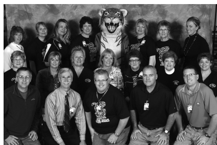
The 2009–2010 SSDF Board members celebrated the opening of the new Smith-Cotton High School, their spirit shining through bright smiles, joined by the Tiger mascot.

October 2025 marks the 30th anniversary of the Sedalia School District Foundation (SSDF). We thank you for the generous donations and continuous support that have powered our growth and success over these three decades.