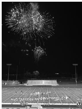
Homecoming fireworks lit up the sky following a Smith-Cotton victory!