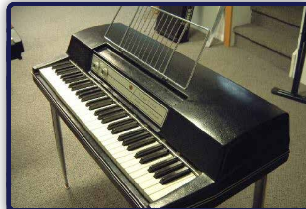
An electric piano

inventing music on the spot to fit with an accompaniment