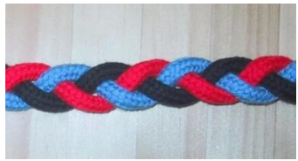
plait / braid

Making a bag decorated with the appliqué/embroidery with a plaited handle for their own/a family member's/a friend's use at home