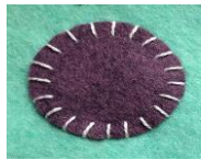
overcast stitch whip stitch