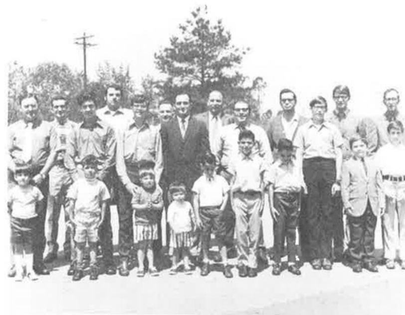
Men of St. James' Church