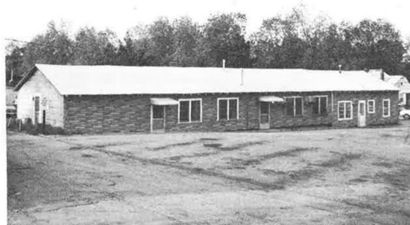
The Agriculture Building "down behind the jail".