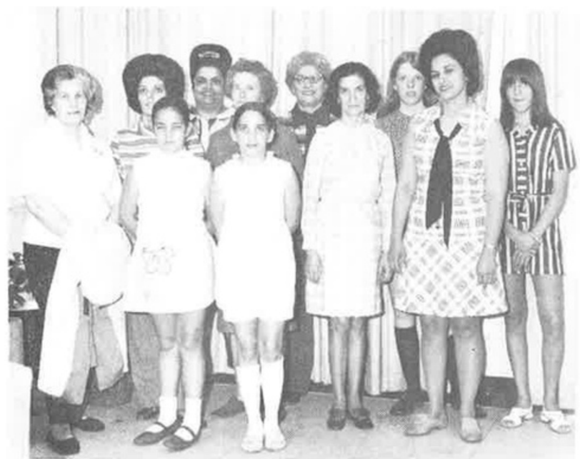
Ladies of St. James' Church