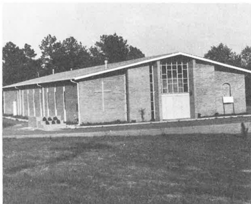
Exterior of St. James' Church