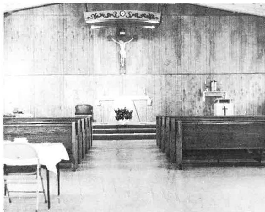
Interior of St. James' Church