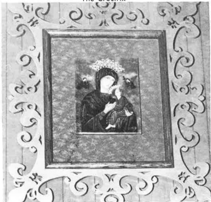
Our Lady of Perpetual Help