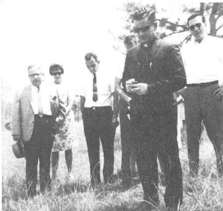
Blessing of the Ground