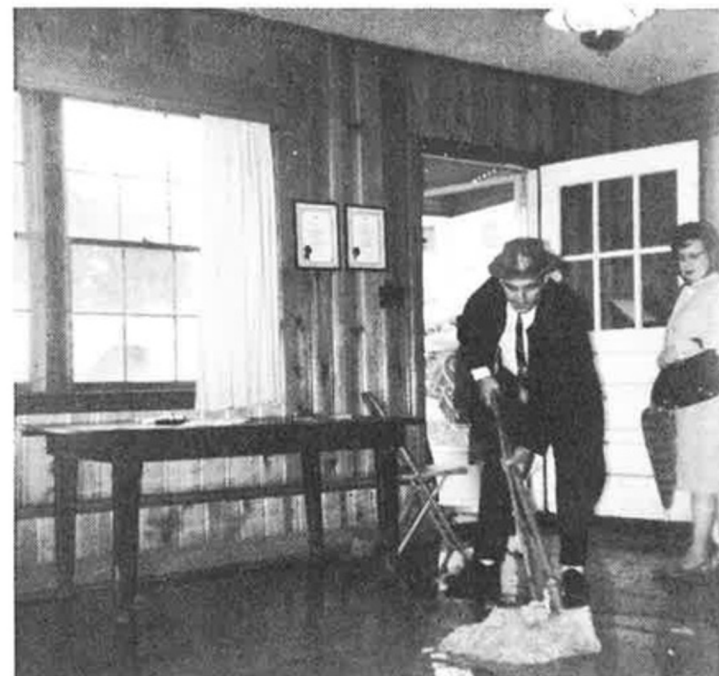
Agriculture Building: "It's no fun doing this on Sunday morning."