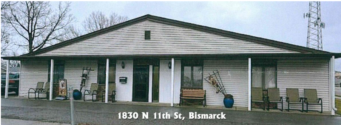
1830 N 11th St, Bismarck

As of February 23, 2026, the offices of the Western North Dakota Synod of the ELCA are located at 1830 North 11th Street in Bismarck . We invite you to stop by and check out our new digs!!