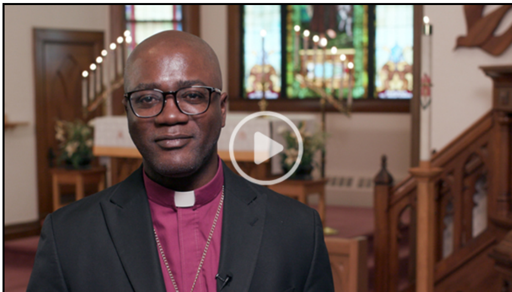
The Joy of Alleluia